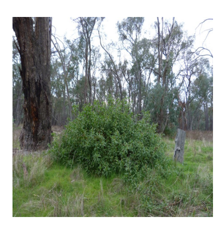
Newsletter 229 June 2014