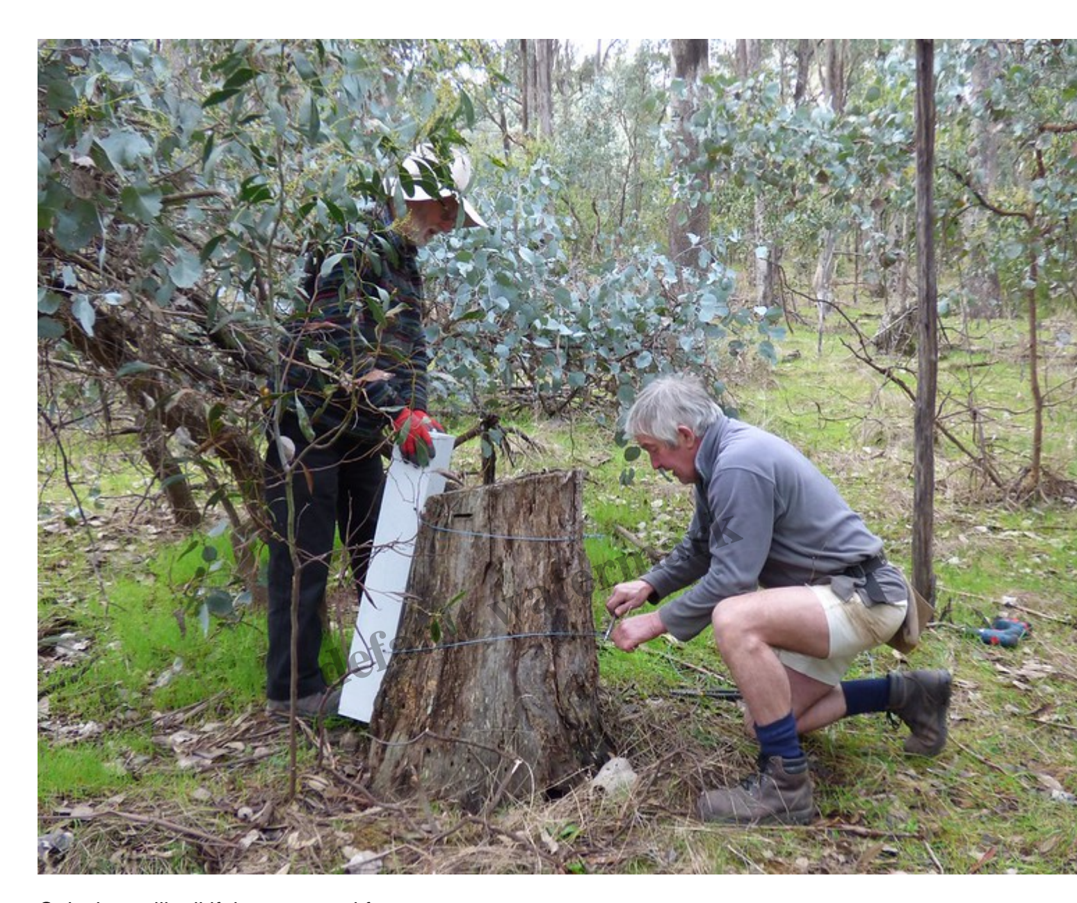
Only time will tell if they succeed for us.