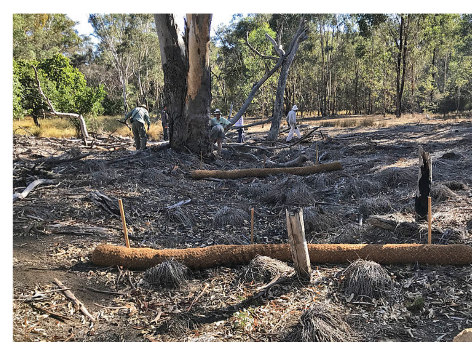
The group of twelve soon accomplished the allocated tasks and we all gathered in the shade for some bun and a good chat.