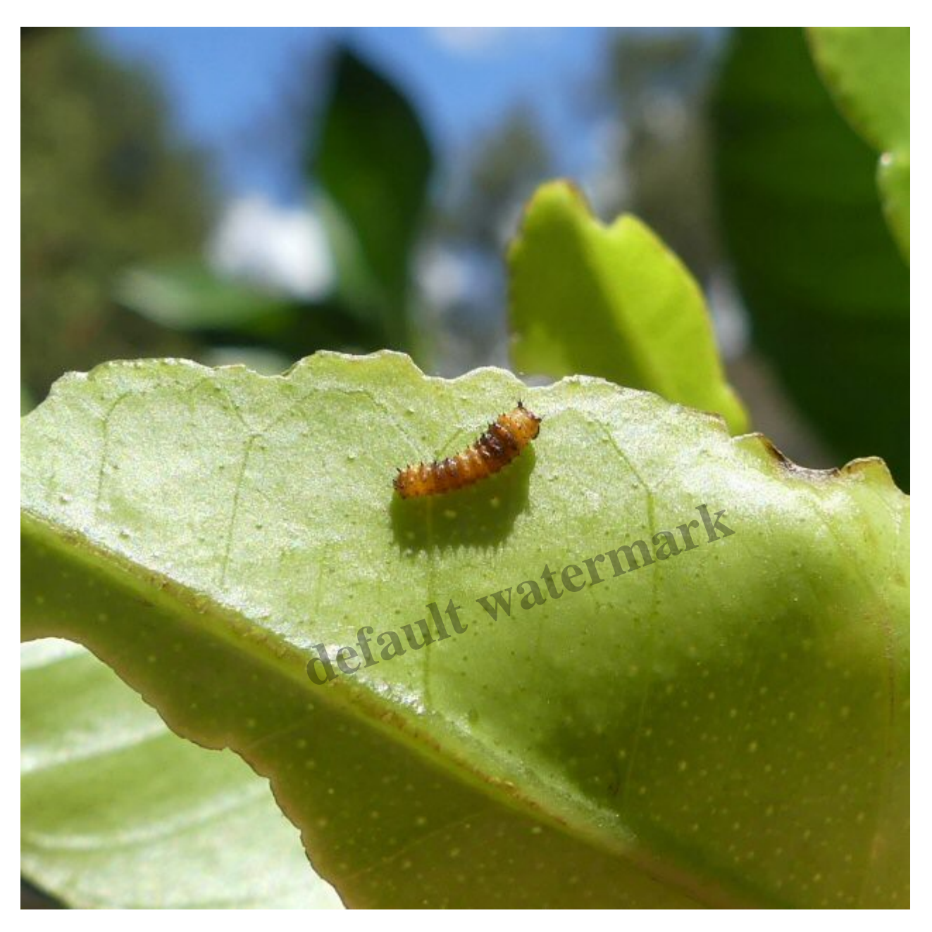
It moved down into the more woody section of the tree where it pupated, constructing a little slinglike thread to attach itself to the stem.