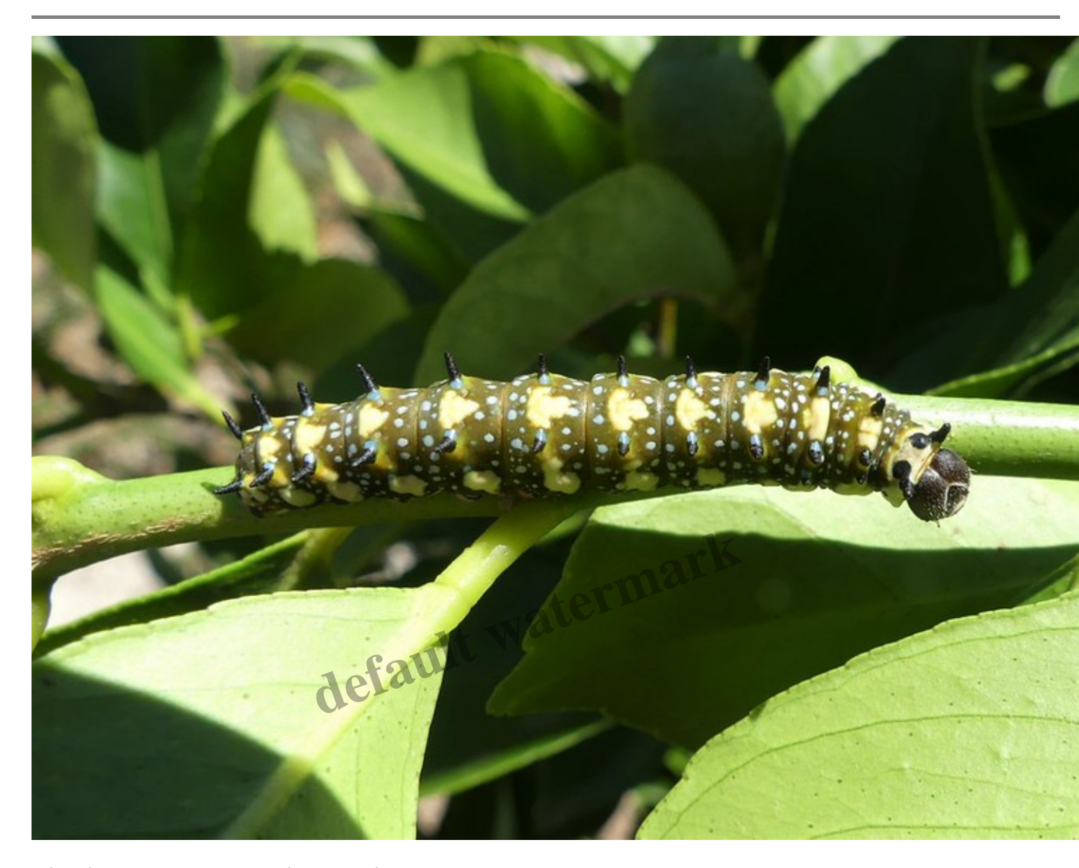
After five days the beautiful butterfly emerged