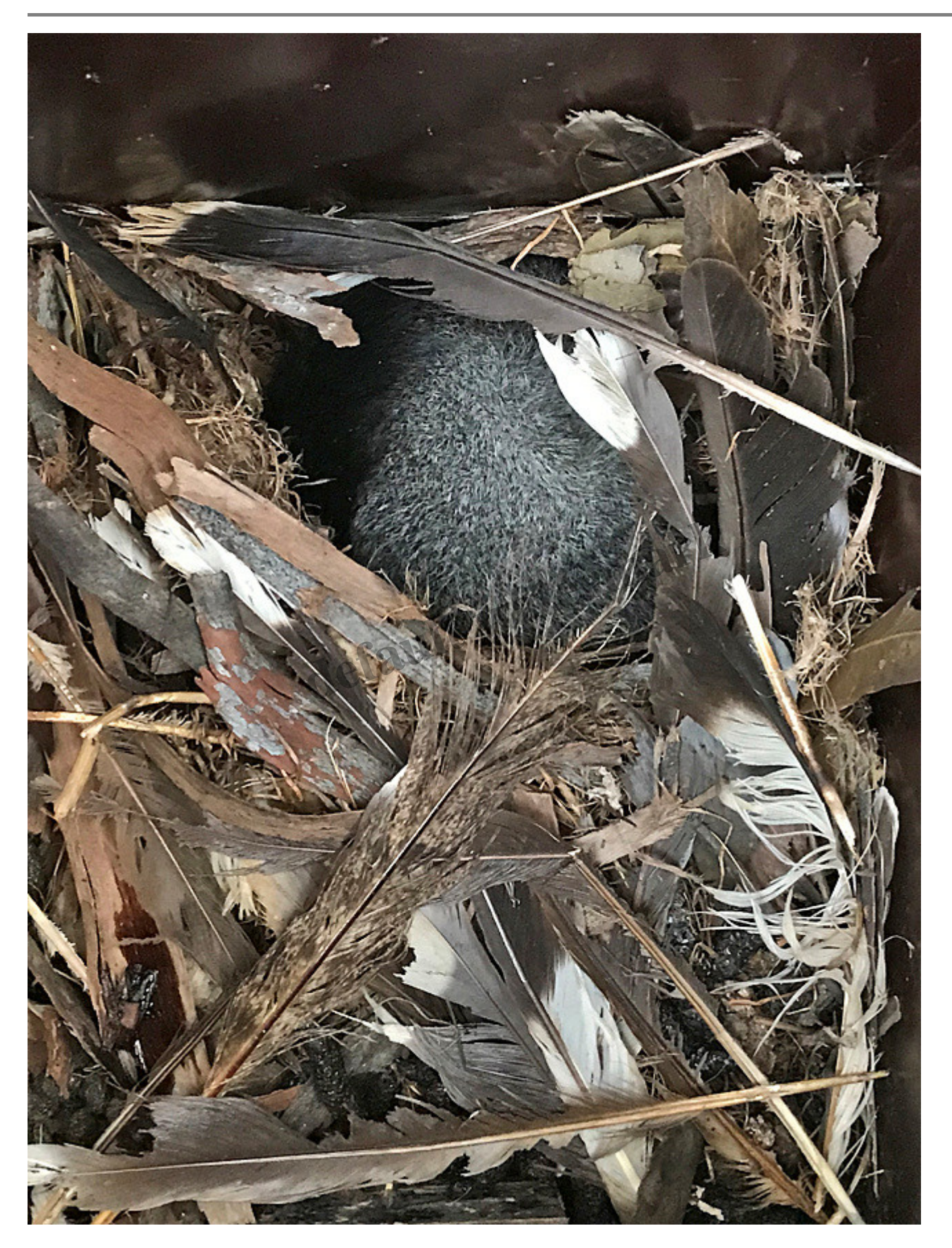
Two boxes held Squirrel Gliders, one a nest full of sleepy Sugar Gliders another with honeycomb and a