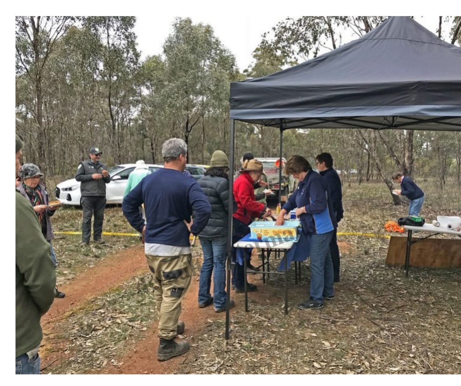
By the end of day one we had just 600 plants left to hand plant on Sunday. The work was completed by 11.30 am on Sunday and we enjoyed a lunch of soup and sandwiches provided by Chiltern Red Cross Ladies.