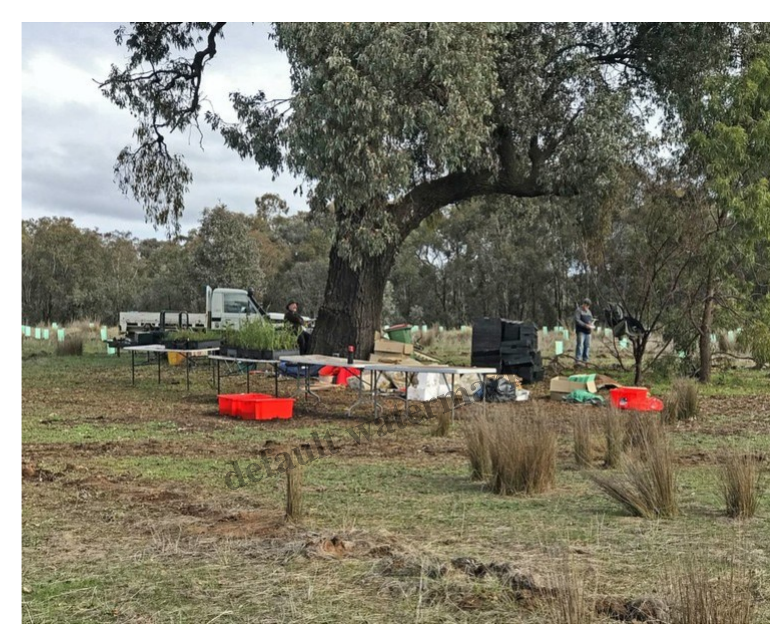
Many thanks to Jan and her daughter for operating the magic machine and for her donation of 1000 weed mats which were used on the hand planted shrubs.