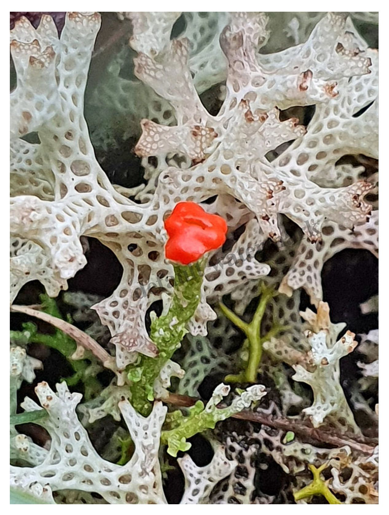
Coral lichen (Cladia retipora) and British soldiers lichen (Cladonia cristatella)