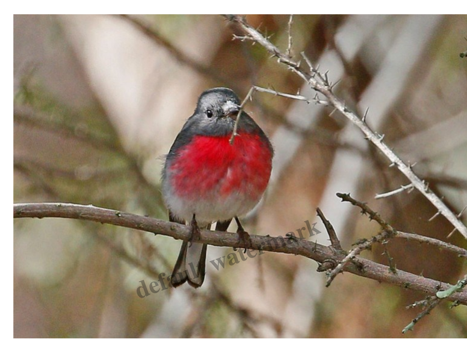
A male Rose Robin (Petroica rosea)

This bird kept the photographers busy by mostly keeping its back in their direction to the delight of the other observers who enjoyed wonderful views of the front of the bird. It is the first time that I have seen this species at Bartley's Block.