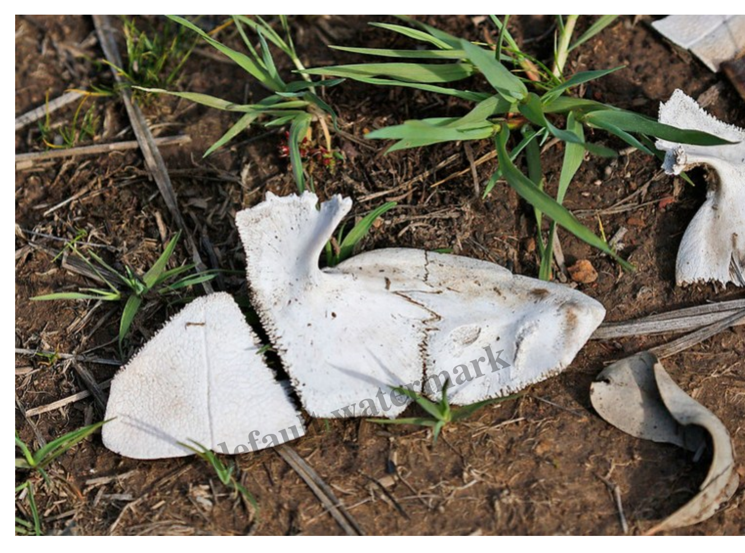
A plastron, or lower shell, of a turtle

Another discovery was a fungus that could only identified to a genus level but it is commonly known as a puffball.