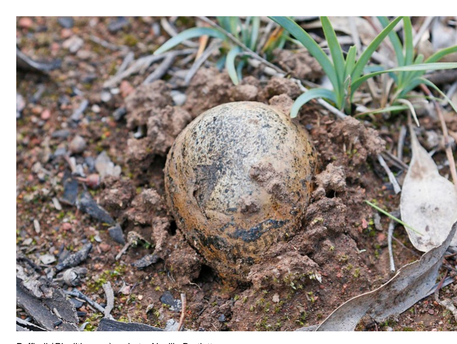
Puffball (Pisolithus sp.)

Having several skilled bird watchers present also resulted in the discovery of a male Rose Robin ( Petroica rosea ).