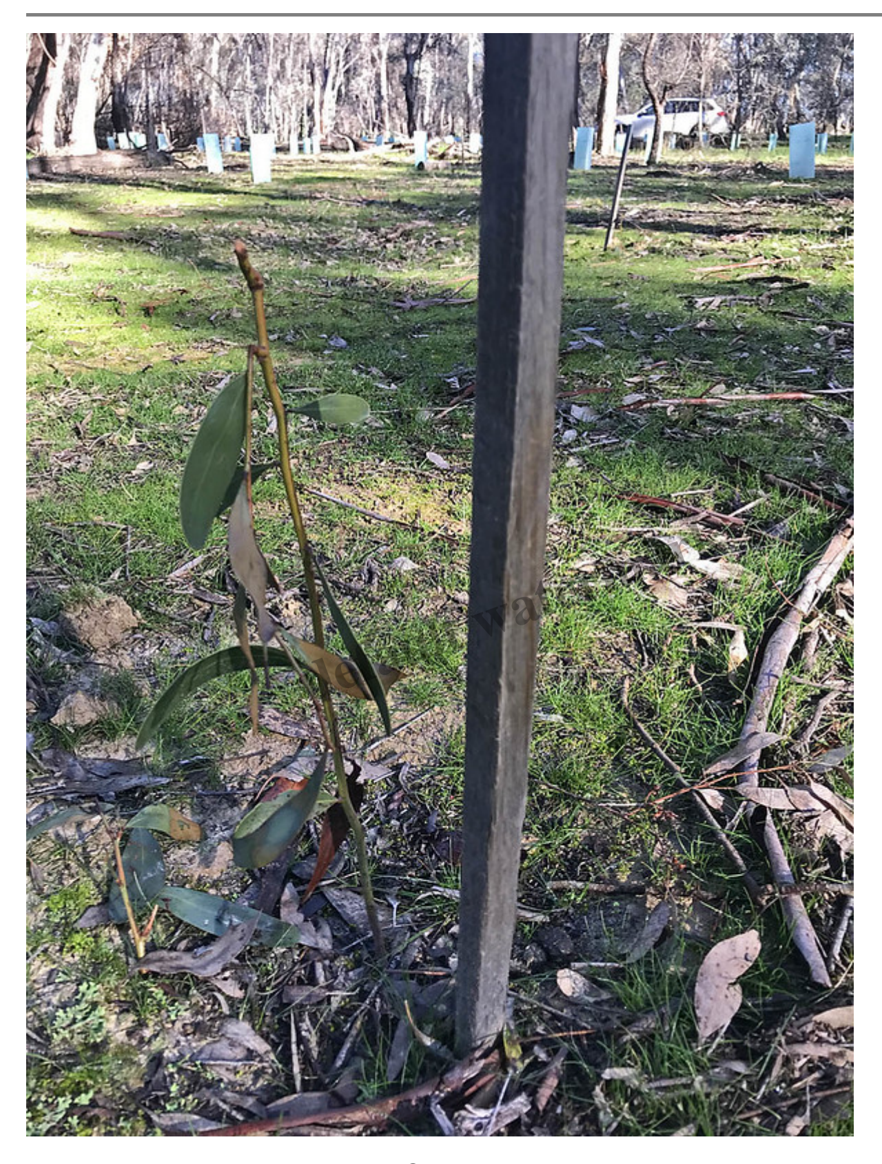
Tree guards, no longer required at the Grasslands Block, were reused to help protect 20 to 30 damaged plants that no longer had guards. Some examples of the damaged plants above- Photos: Neville Bartlett