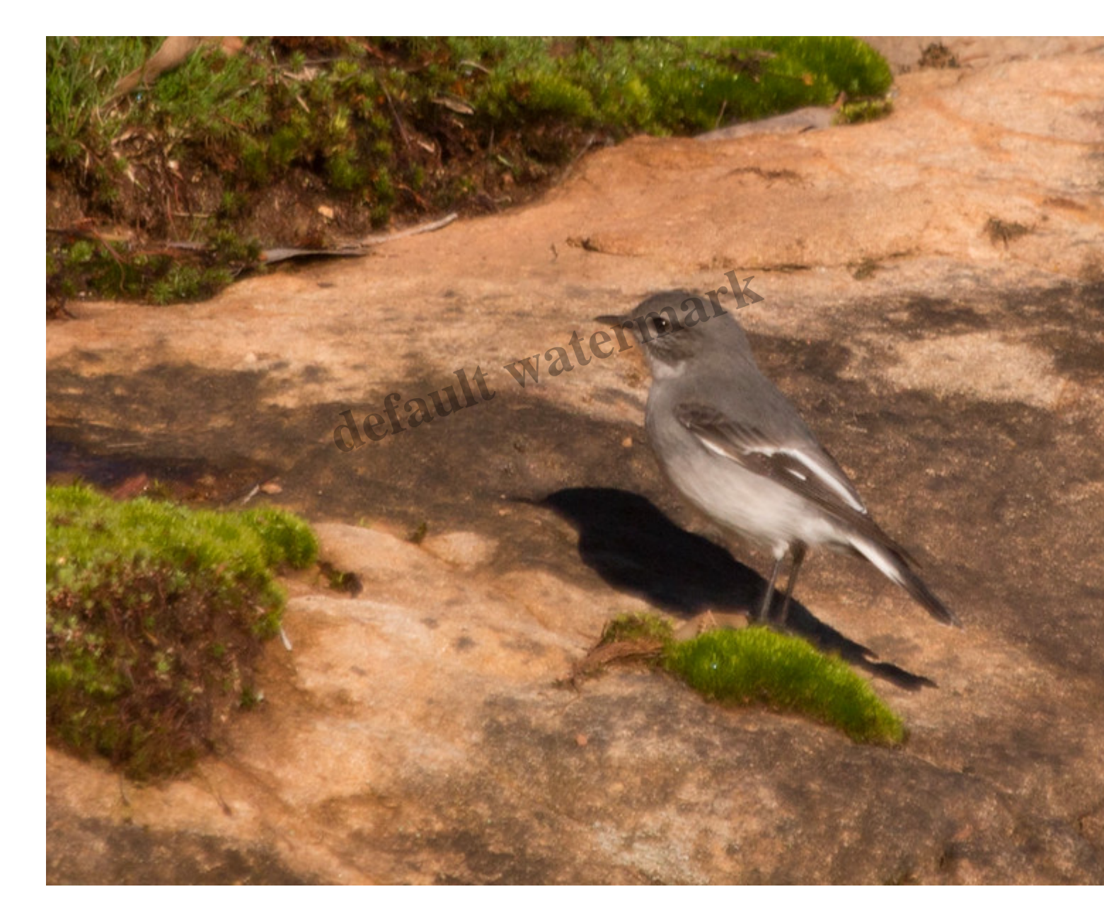
Hooded Robin female