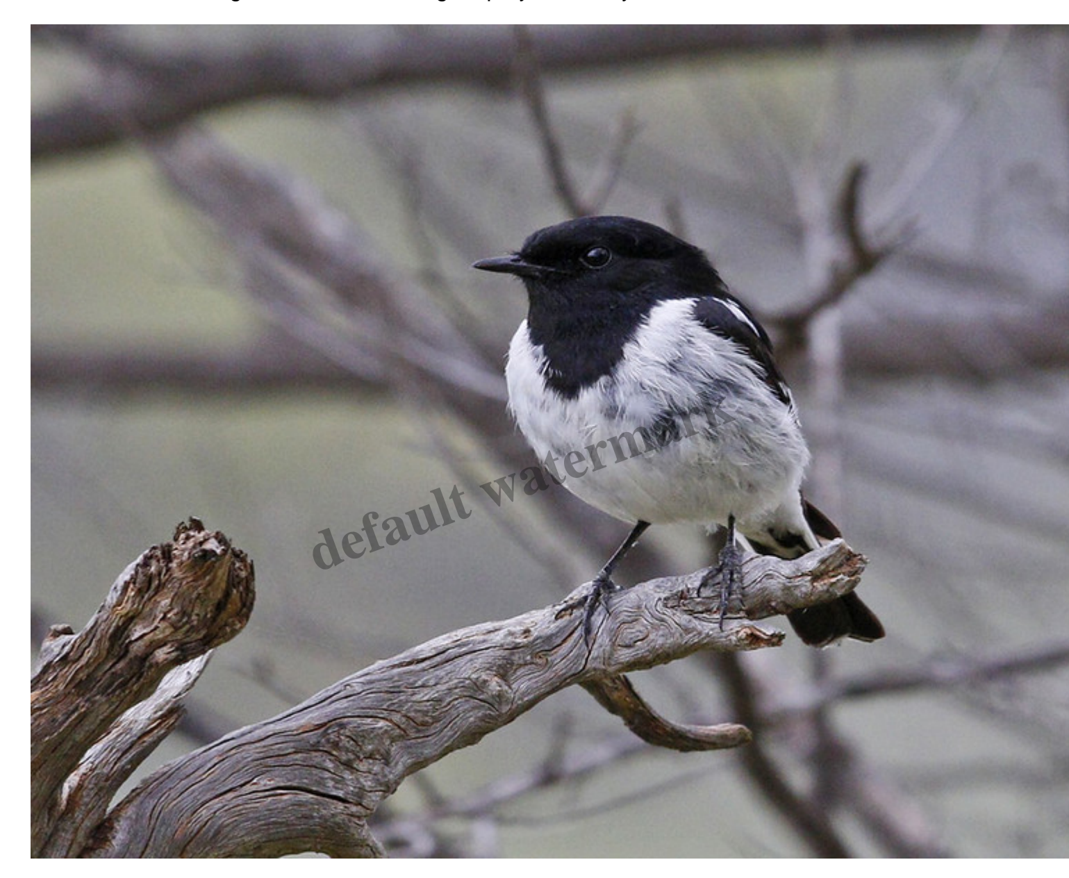
Hooded Robin male

When we think of robins the colours Scarlet, Rose, Pink, Flame and Yellow, our five more obvious and showy robins come to mind. However, the black and white Hooded Robin is not so flashy and along with its habit of sitting motionless watching for prey it is easily overlooked.