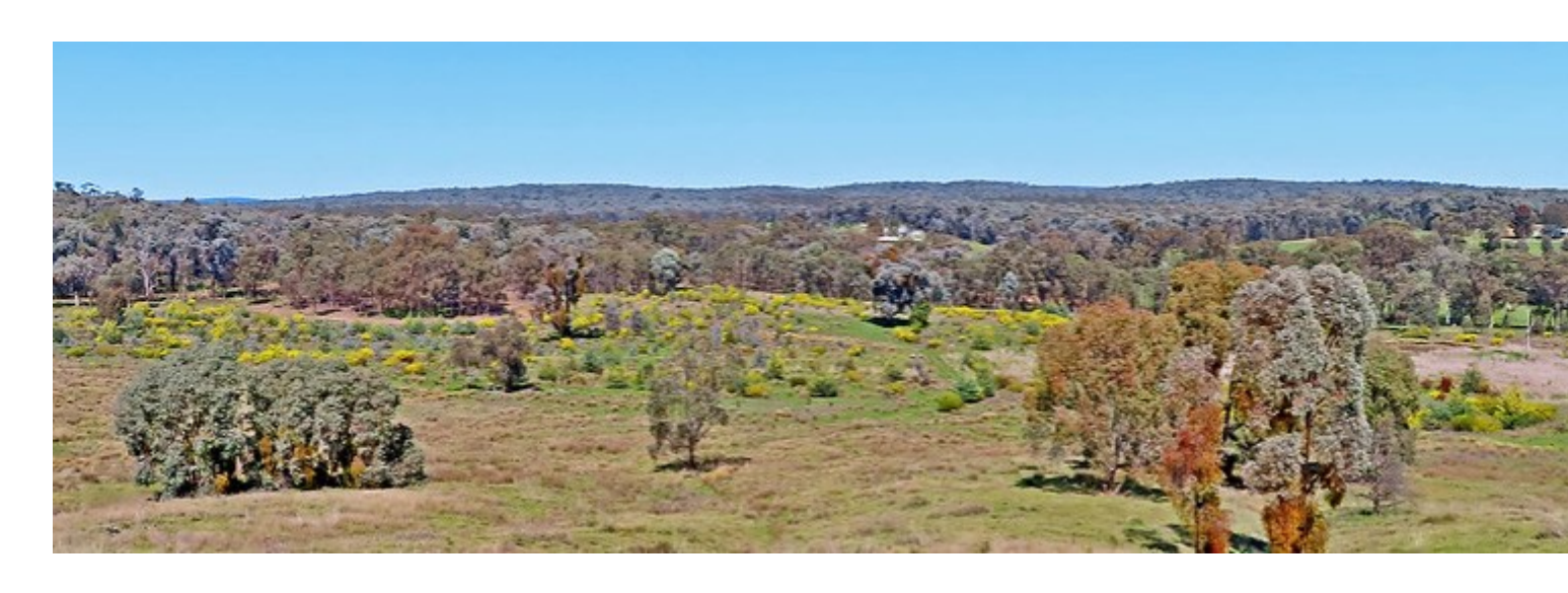
A panoramic view of the planted area showing the rapid growth – Photo: Mick Webster

Recent images of the planted area – Photos: Neville Bartlett (left) and Mick Webster (right)