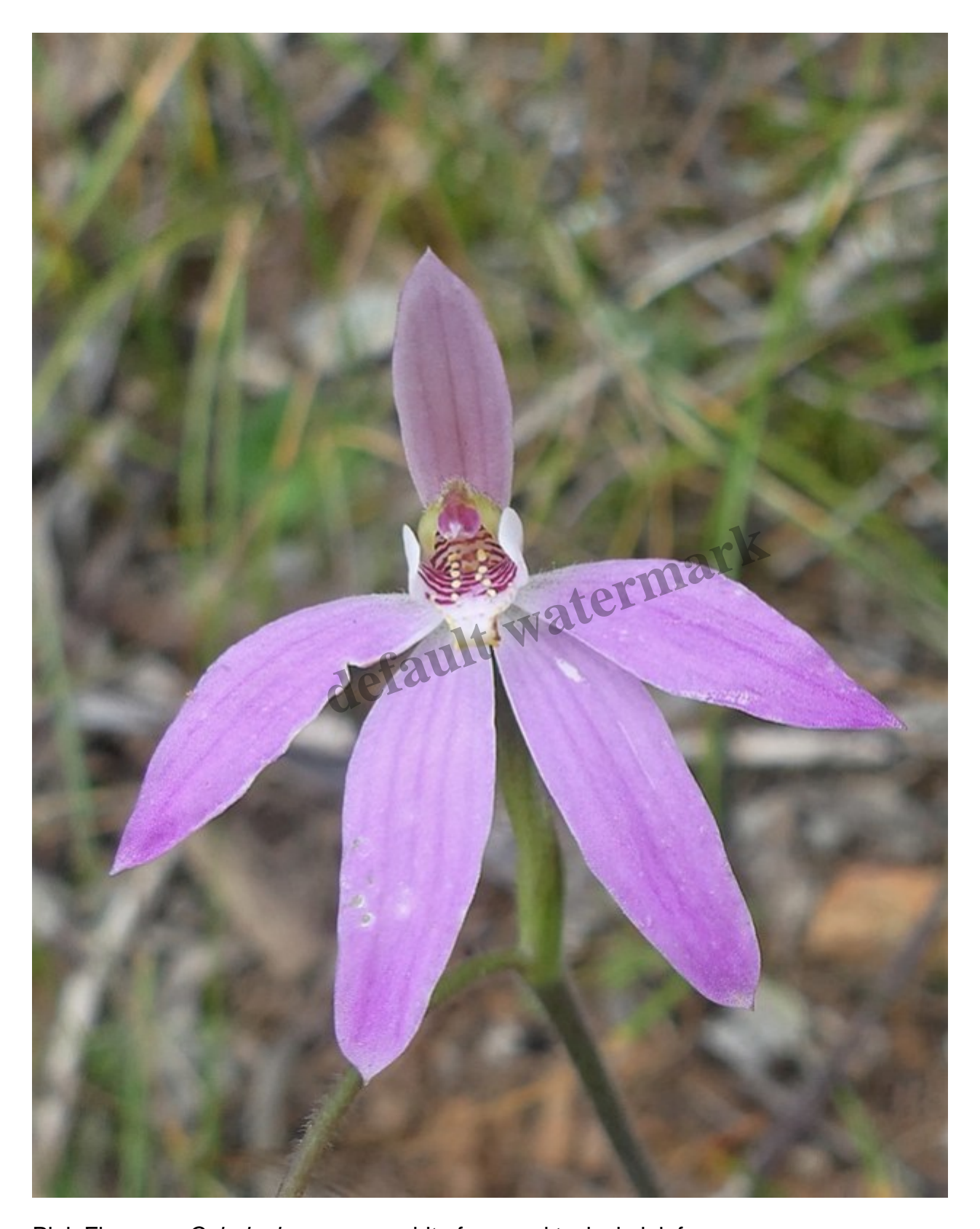
Pink Fingers – Caladenia carnea – white form and typical pink form