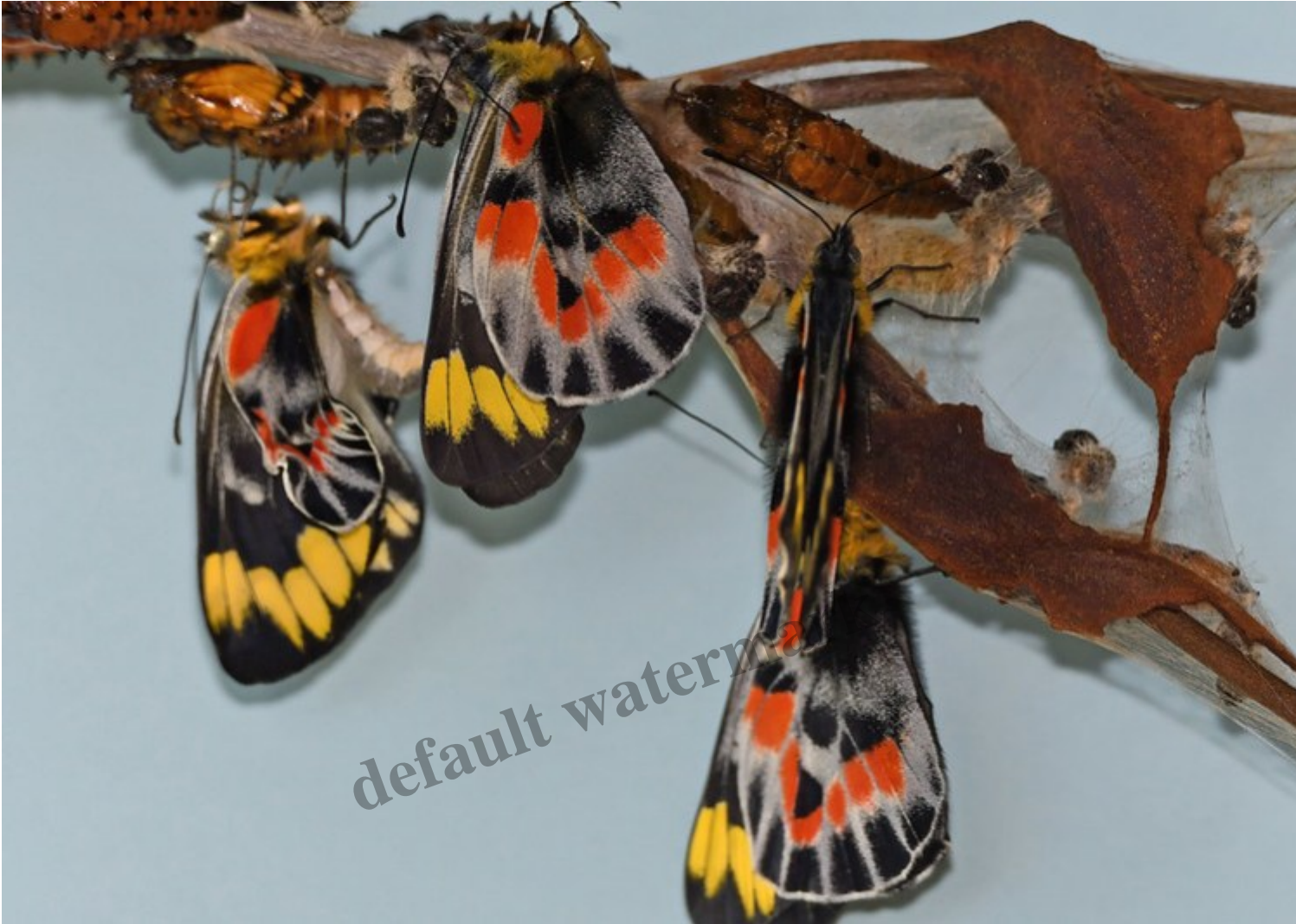
Imperial Jezebel Butterfly – Delias harpalyce – recently hatched