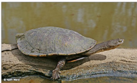
Eastern Long-necked Turtle ( Chelodina longicollis )