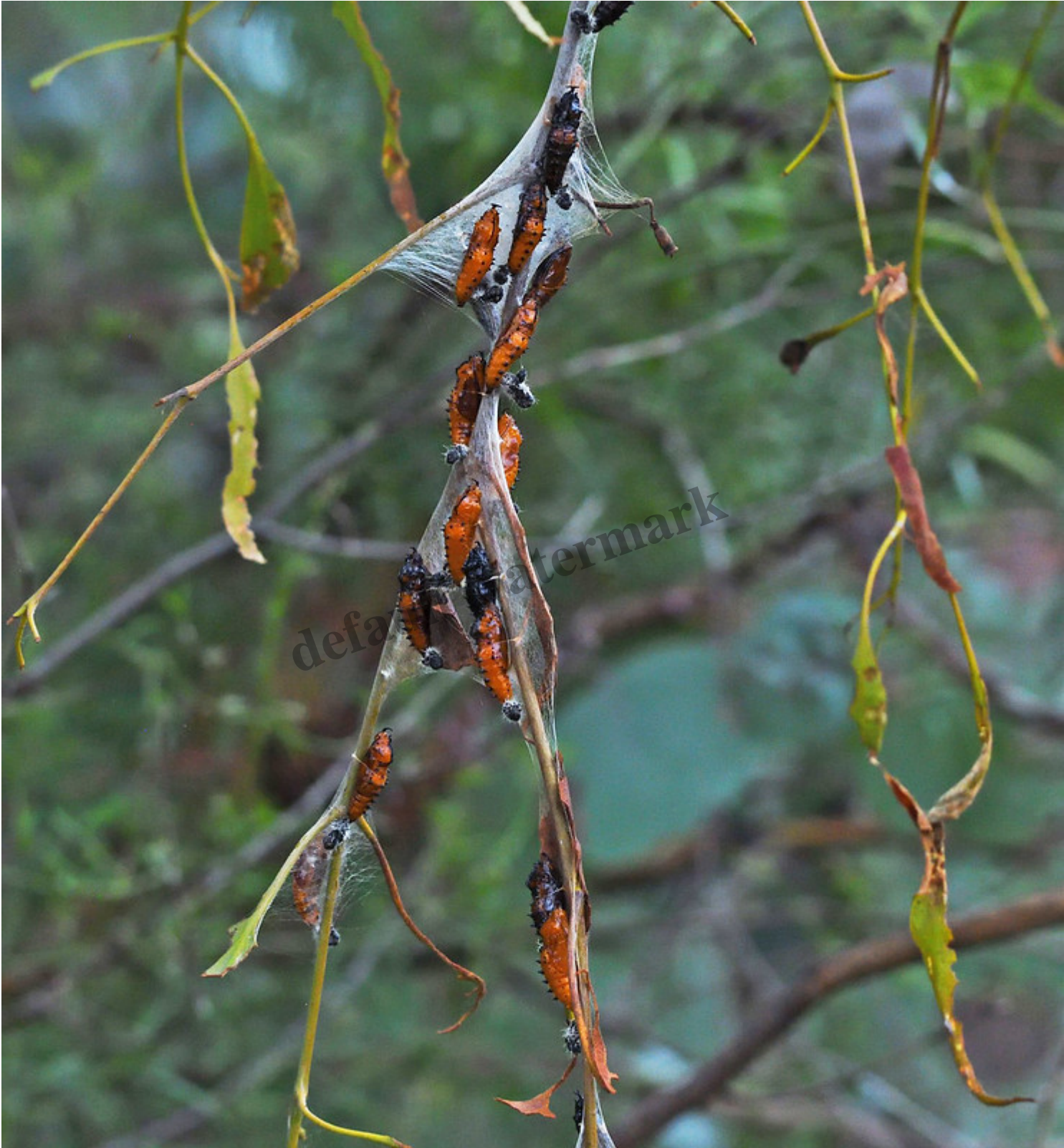
Imperial Jezebel Butterfly – Delias harpalyce – pupae