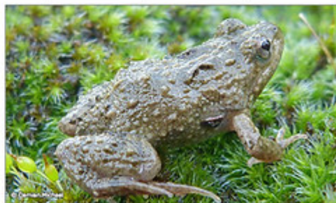
Sloane's Froglet ( Crinia sloanei )

The second format (compact A4) comes as an A4 size that is much more compact and is a little over half of the weight.