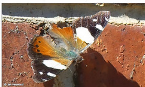
Yellow Admiral - white form ( Vanessa itea )