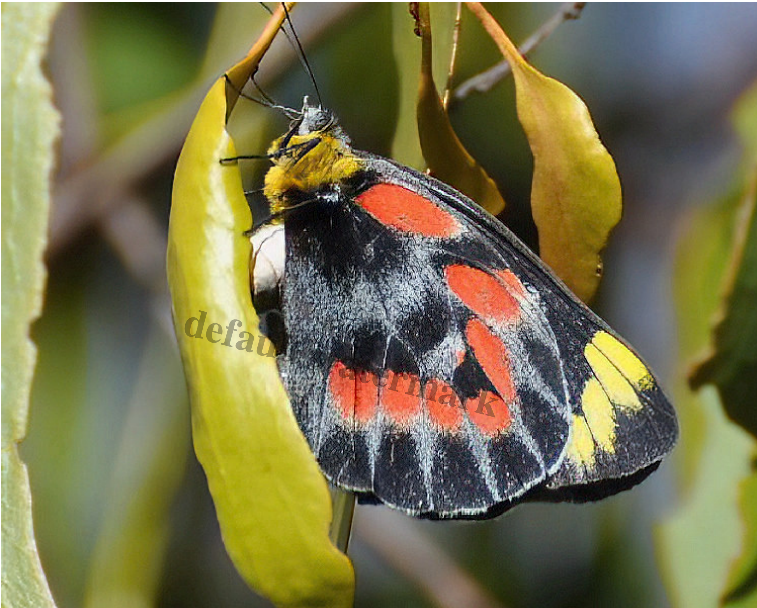
Imperial Jezebel Butterfly â?? Delias harpalyce â?? adult