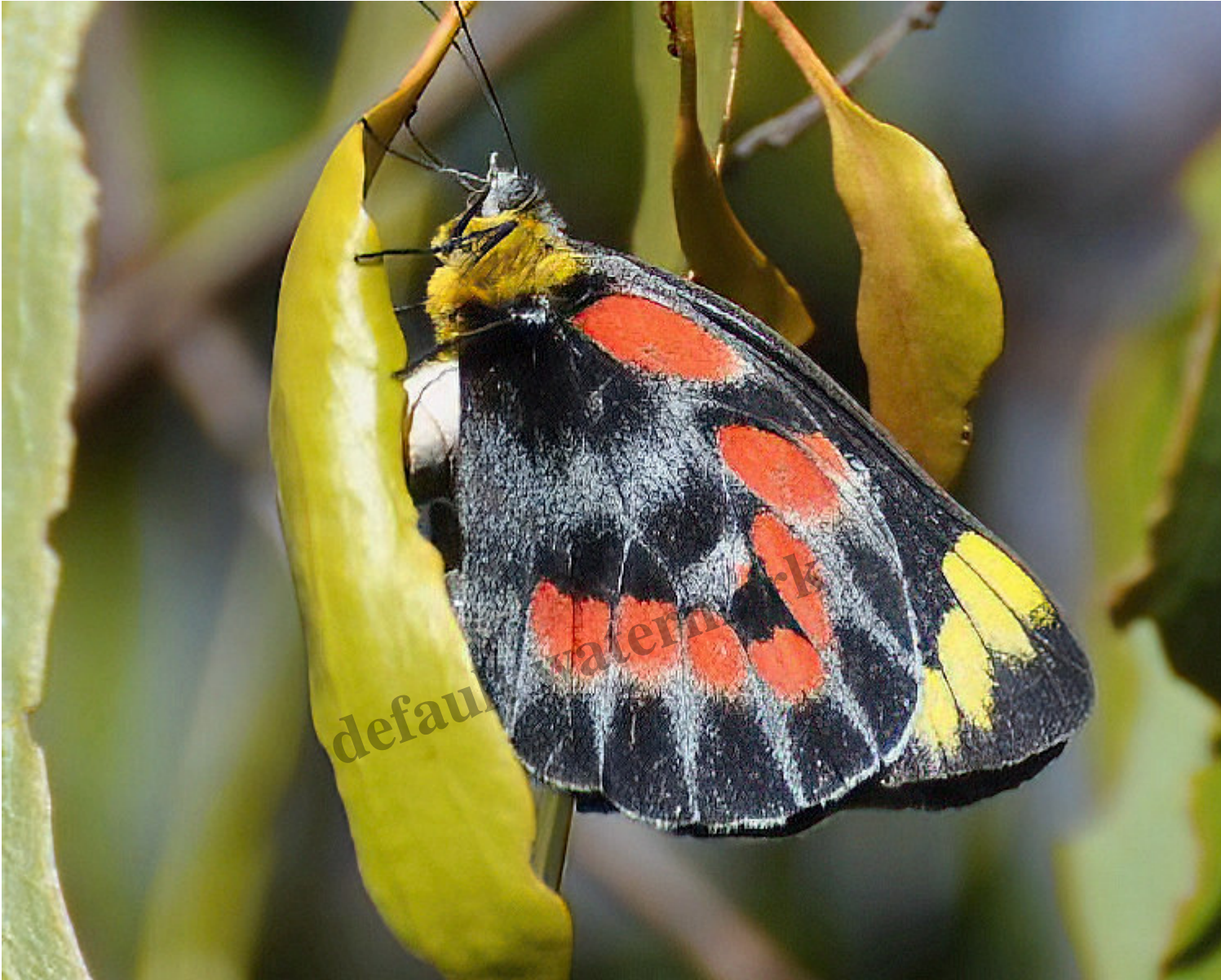
Imperial Jezebel Butterfly – Delias harpalyce – adult