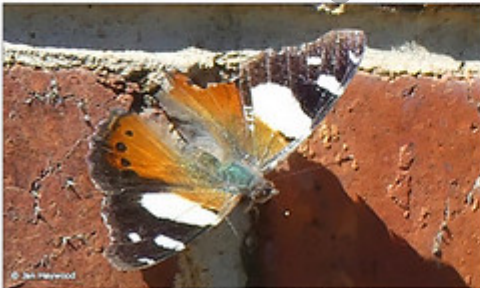
Yellow Admiral - white form ( Vanessa itea )