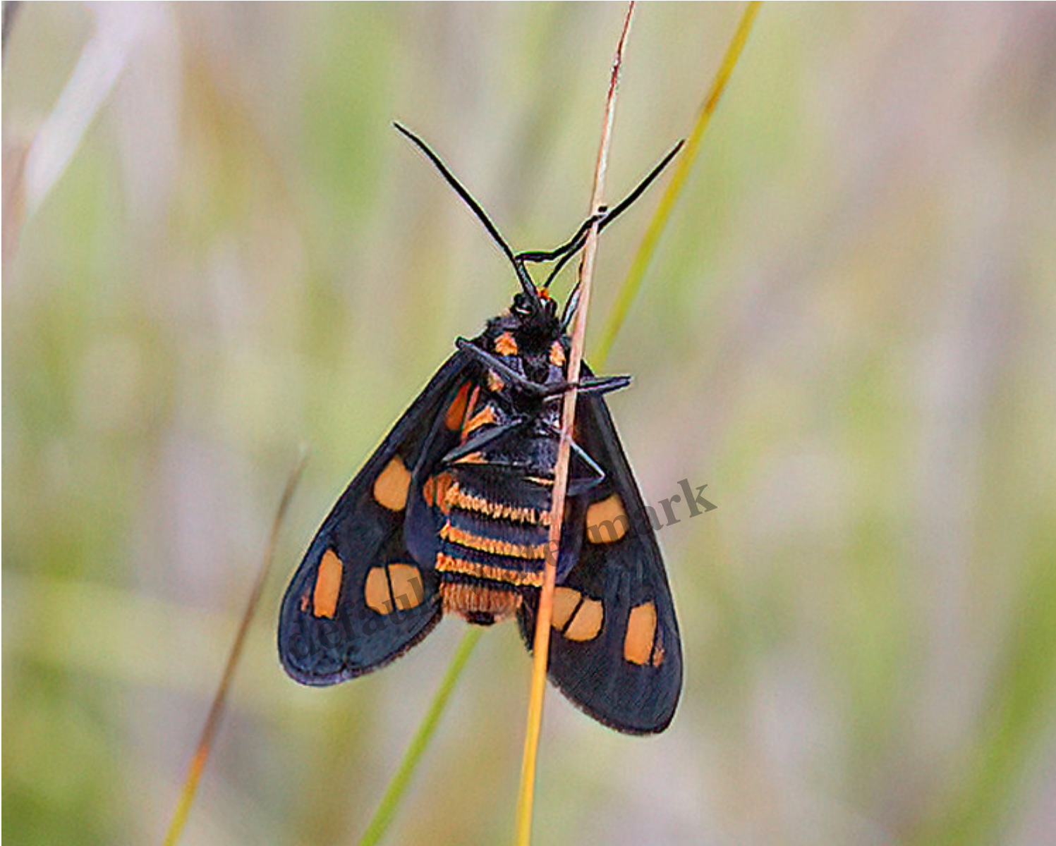
Spotted Tiger Moth ( Arctiidae – Amata sp).