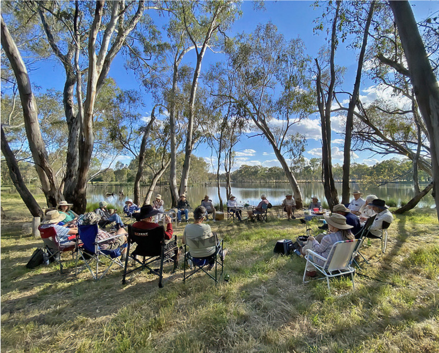
Friends gathered at Chiltern Valley No 1 Dam. Photo: Neville Bartlett

Spotted Tiger Moth – Arctiidae – Amata sp – Eileen Collins