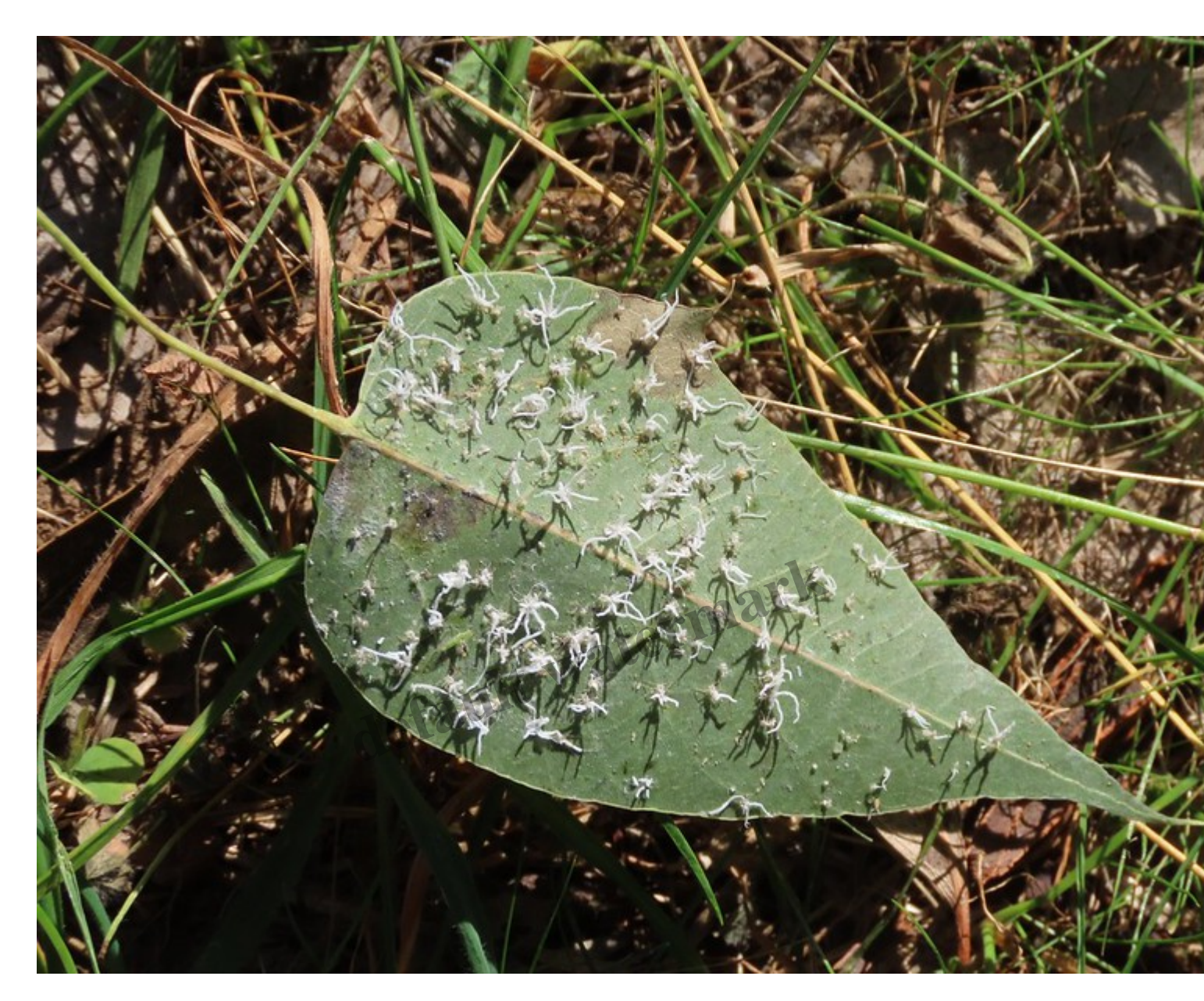
Star Psyllids (Protyora sterculiae).