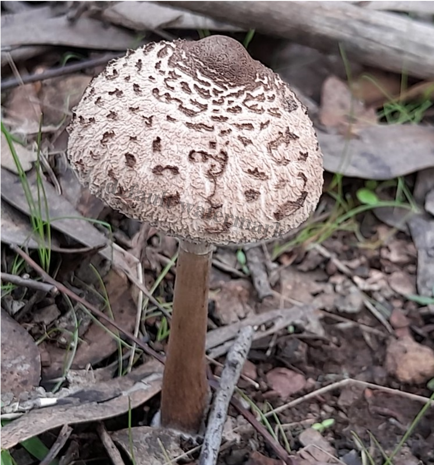
It has been a bumper year for fungi in parts of the Park.