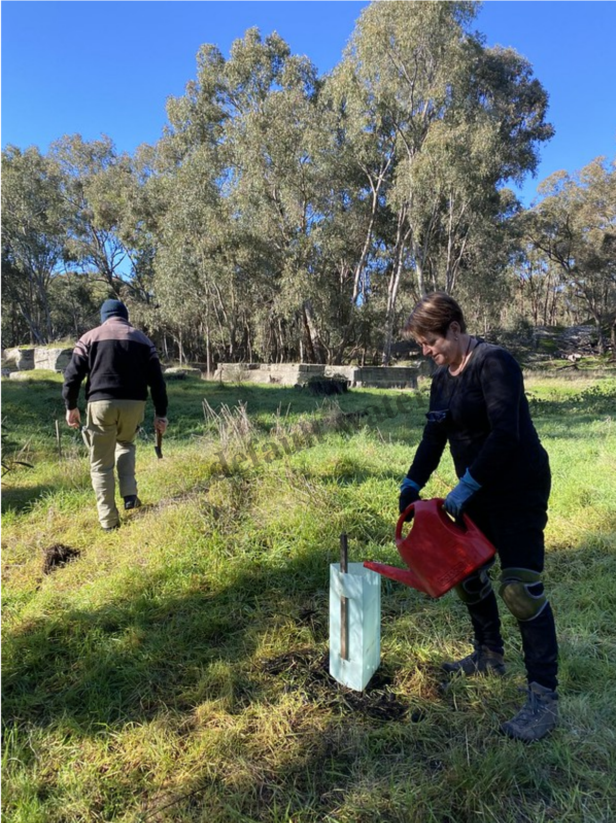
Planting and watering at the RNFR.