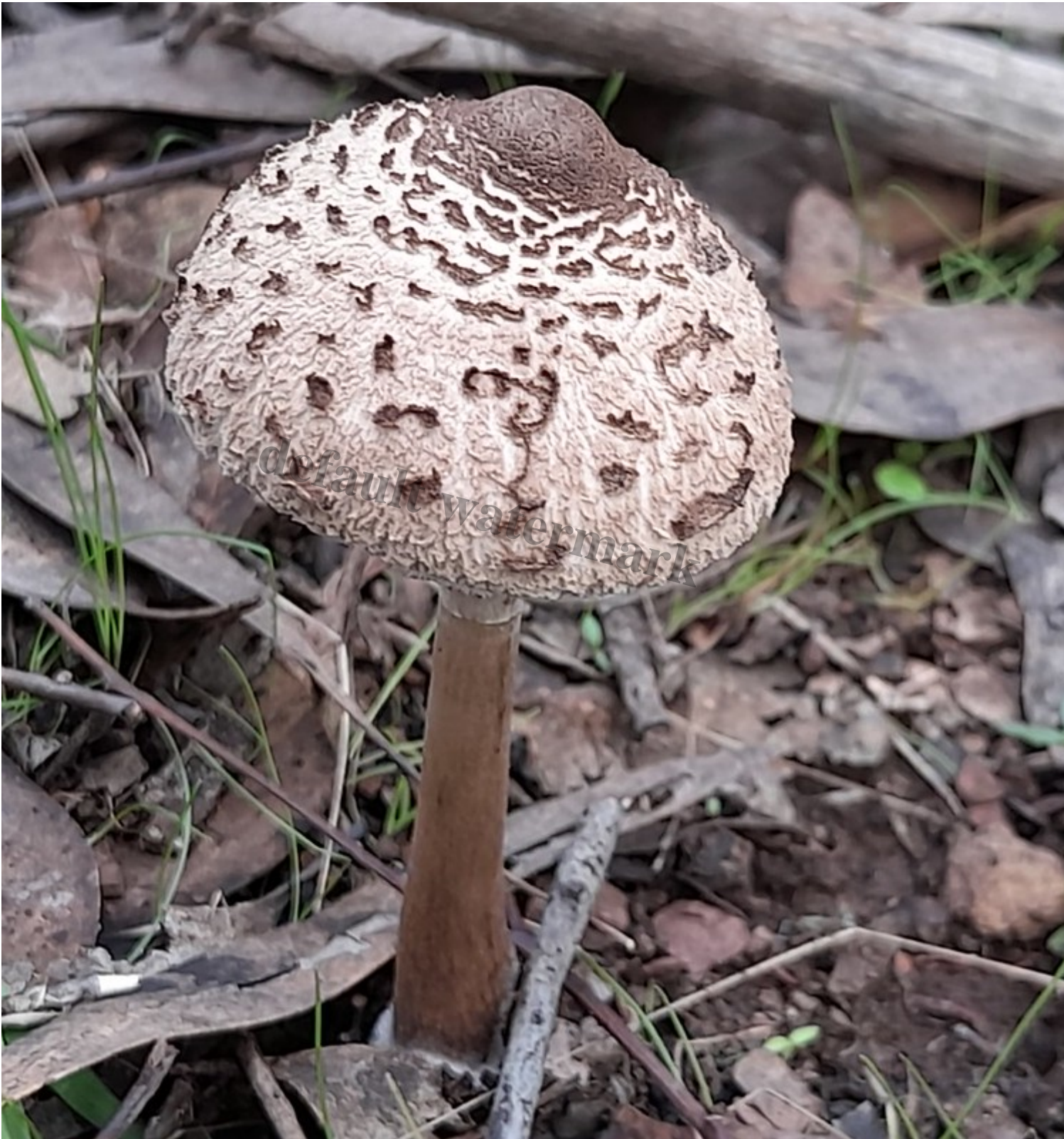
It has been a bumper year for fungi in parts of the Park.