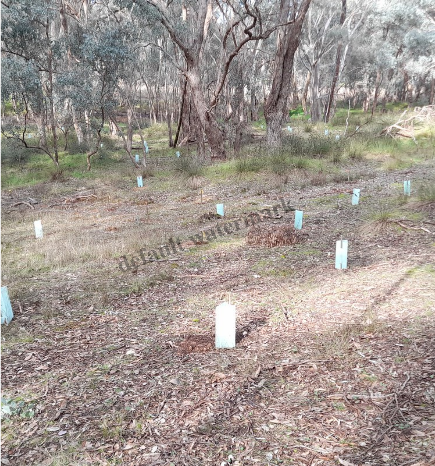
Planting near Frogs Hollow.