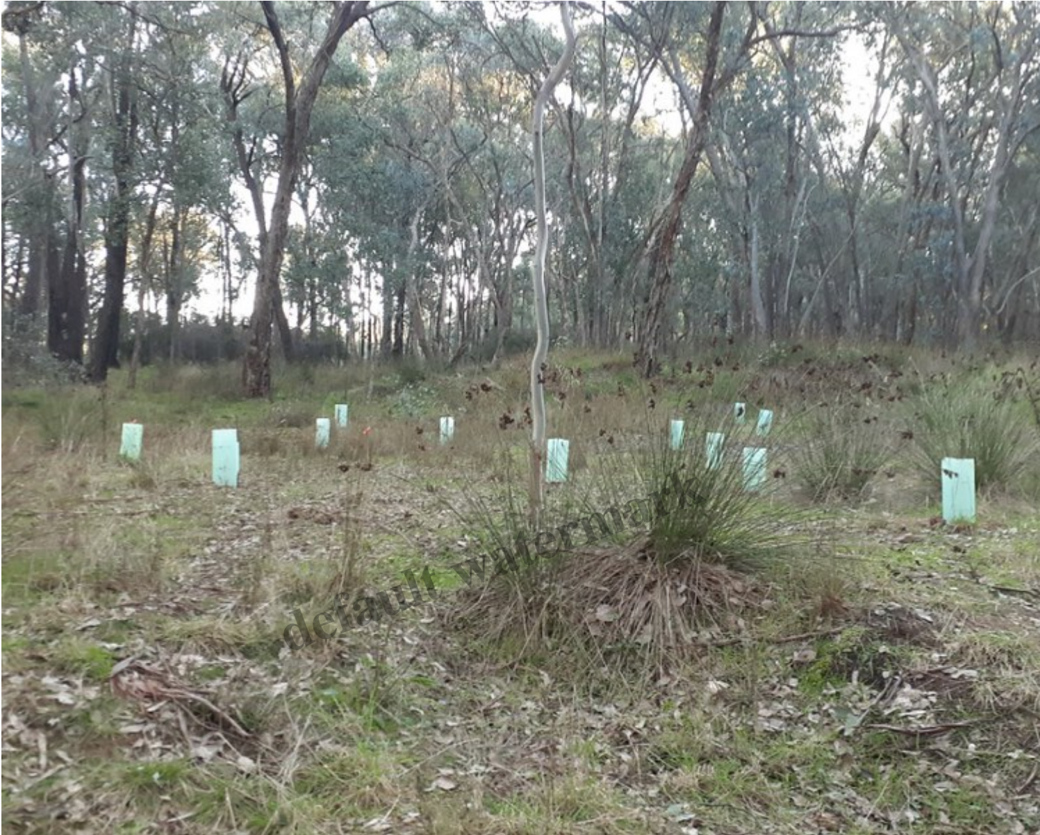
Planting near Frogs Hollow.