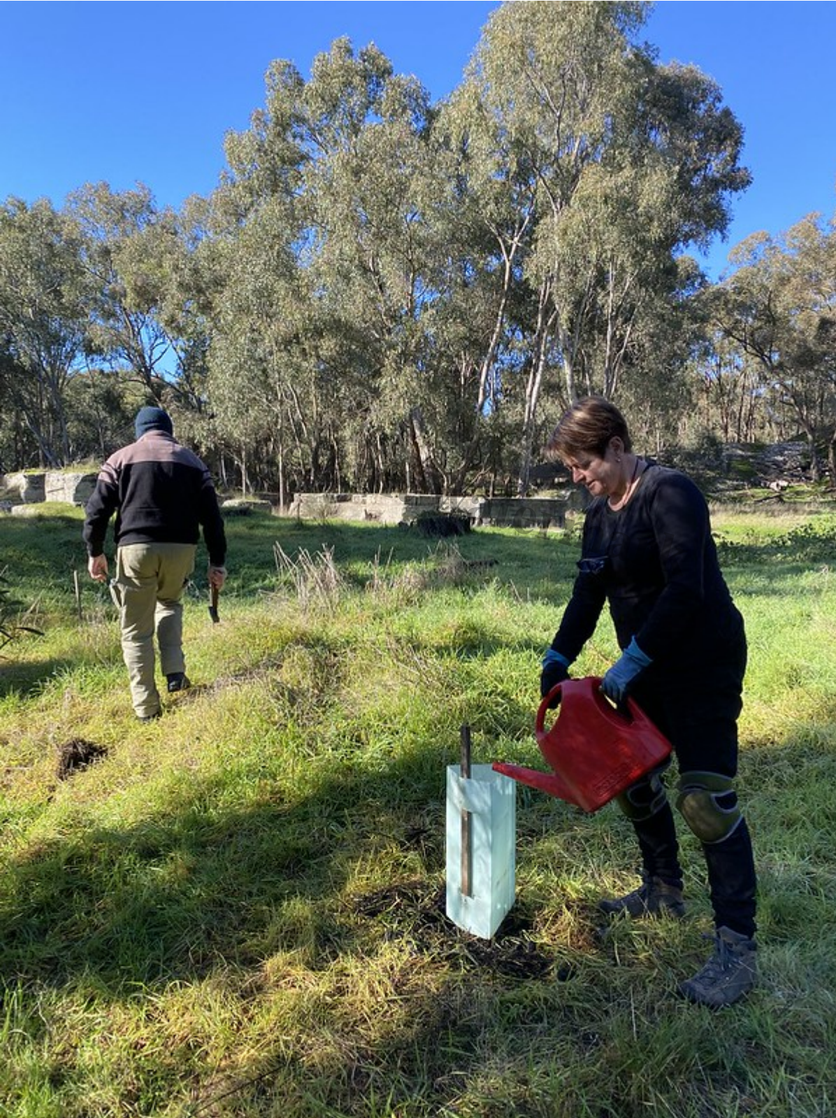
Planting and watering at the RNFR.