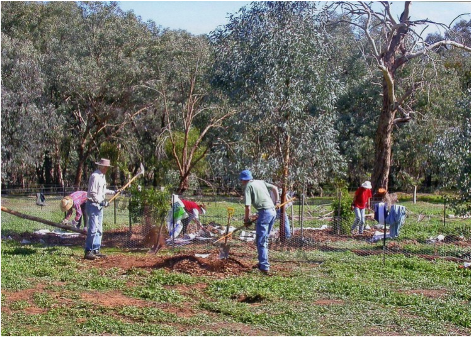
Mulching and planting in 2007.