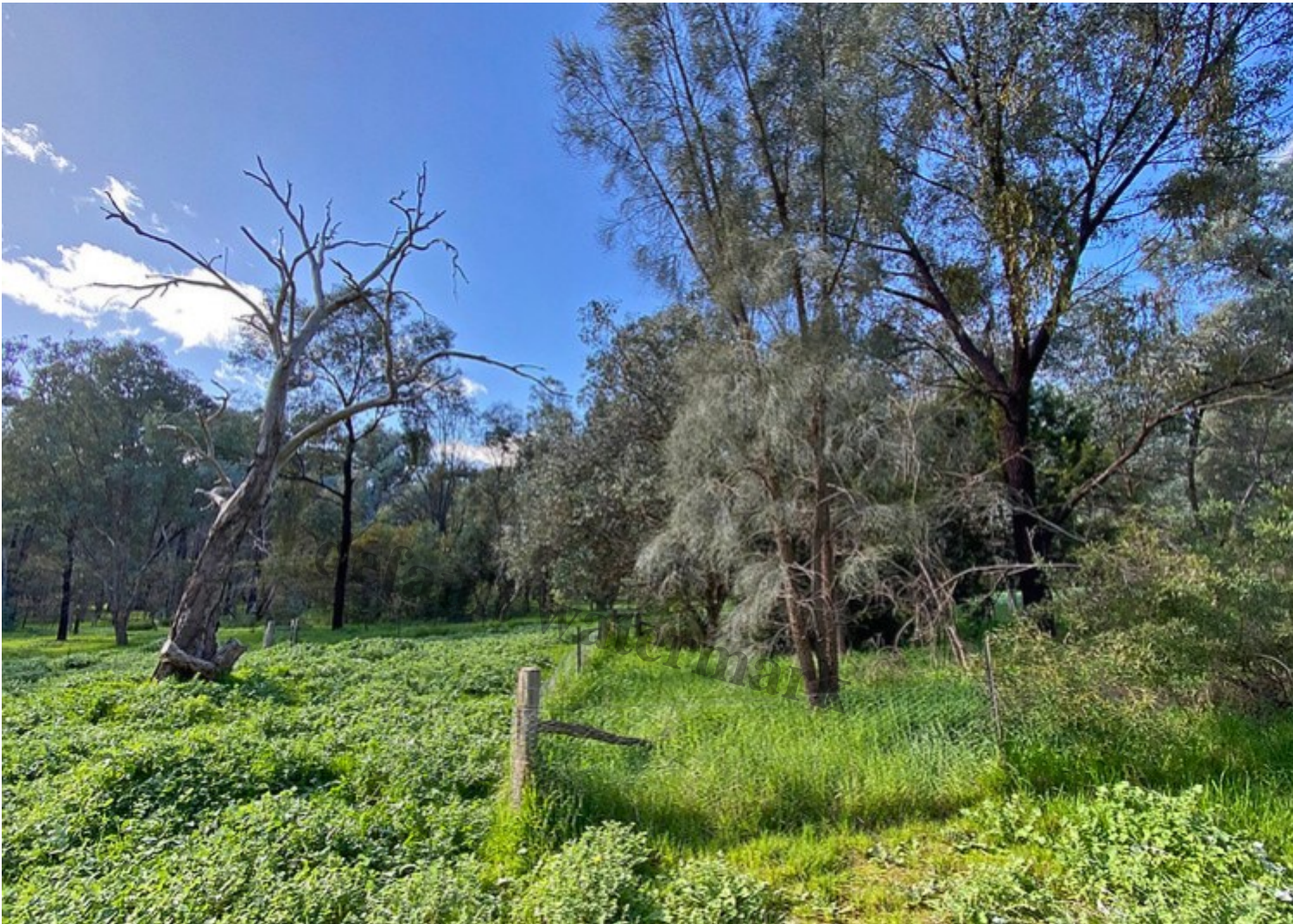
The Tuan Campground area in 2022.