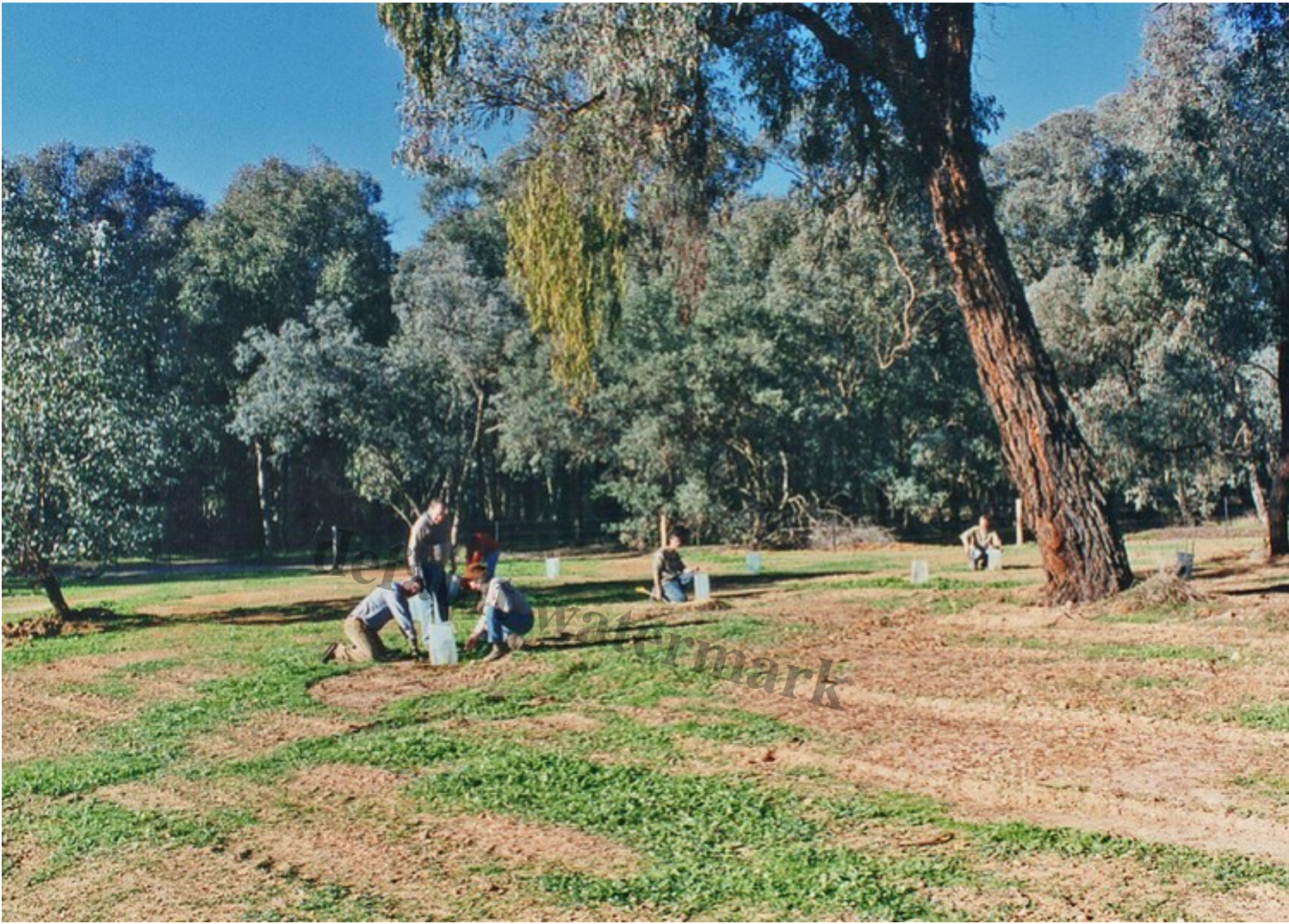
Activities undertaken in 1995.

Then in 2006 and 2007, Friends carried out mulching and a second planting at the site within three enclosures that had been constructed by Parks Victoria.