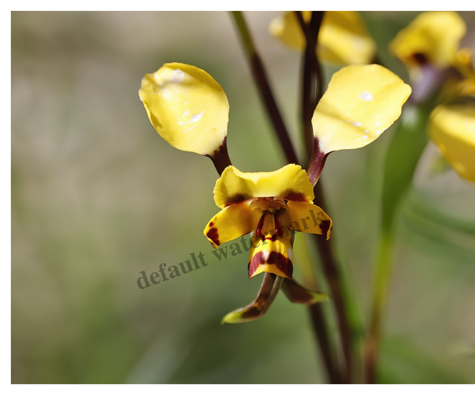
Golden Moth (Diuris chryseopsis)