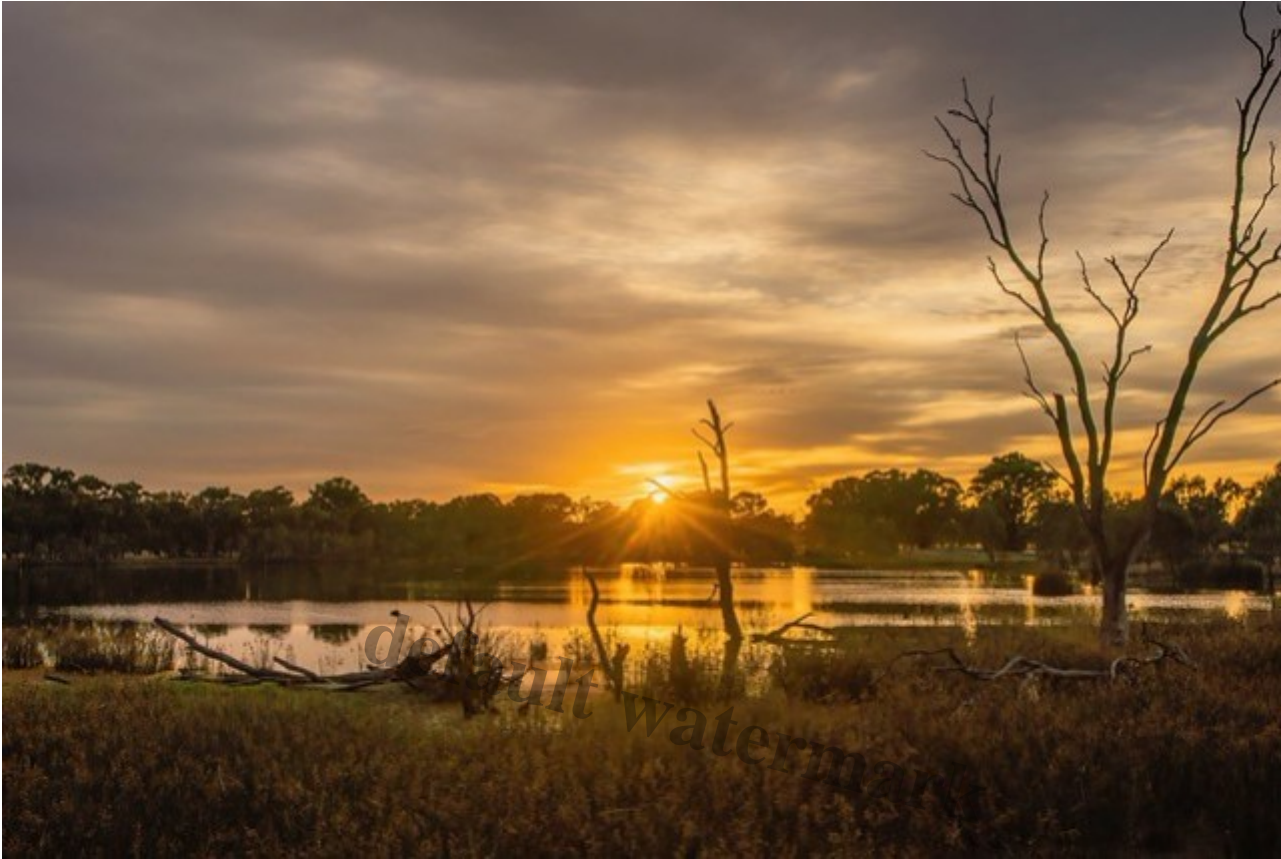
Chiltern Valley No 2 Dam sunrise