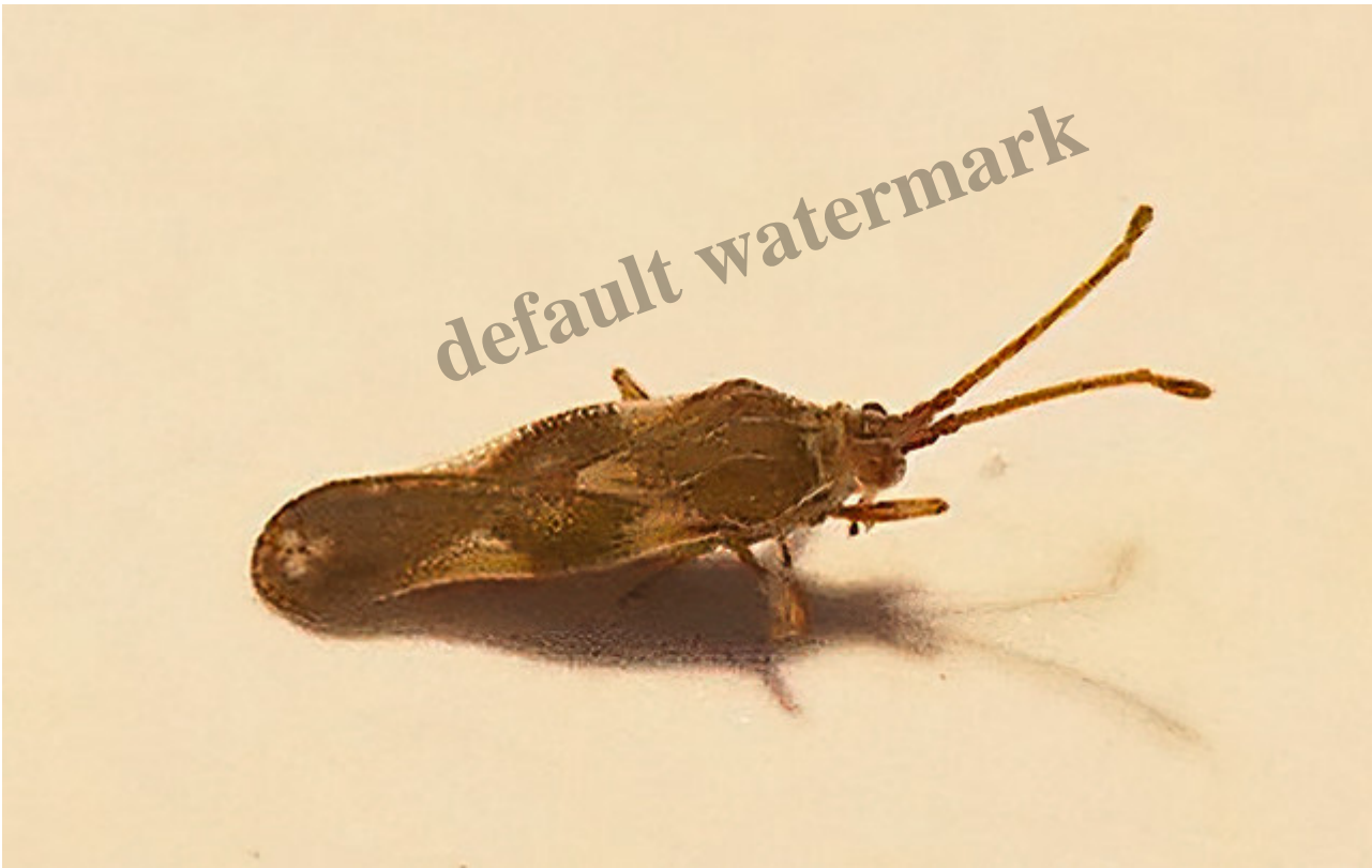
Olive Leaf Lace Bug: dorsal view

https://agriculture.vic.gov.au/biosecurity/pest-insects-and-mites/priority-pest-insects-and-mites/olive-lace-bug