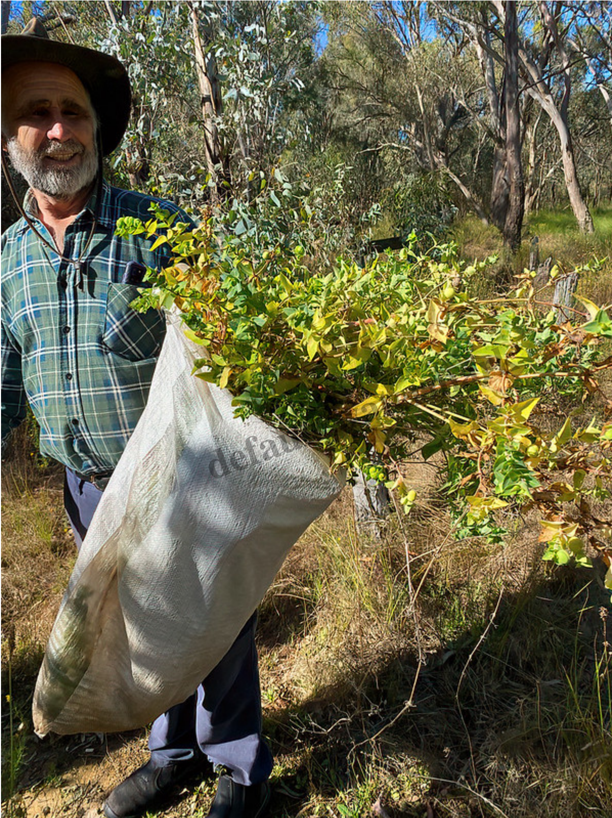
A bag of Caper Spurge

A quick round-up of seeding Caper Spurge ( Euphorbia lathyris ) plants was carried out as this plant has a high risk of getting away from us and in recent years plants have been found closer to Howlong