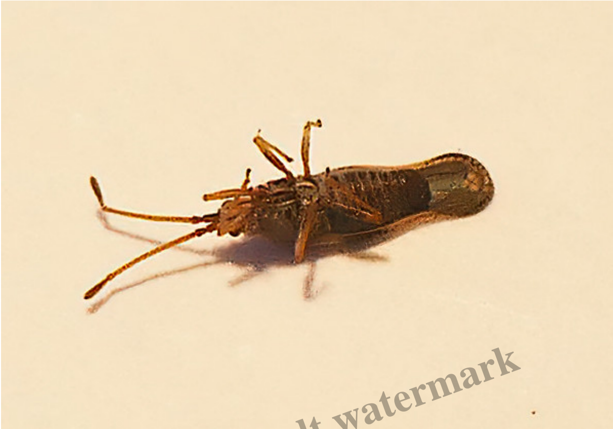
Olive Leaf Lace Bug ventral view (above)