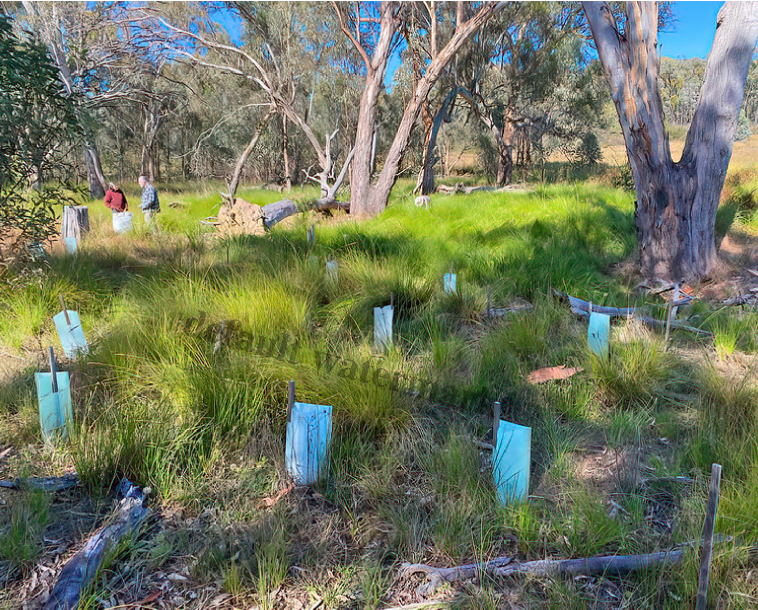
Former vinca area at Bartleys Block