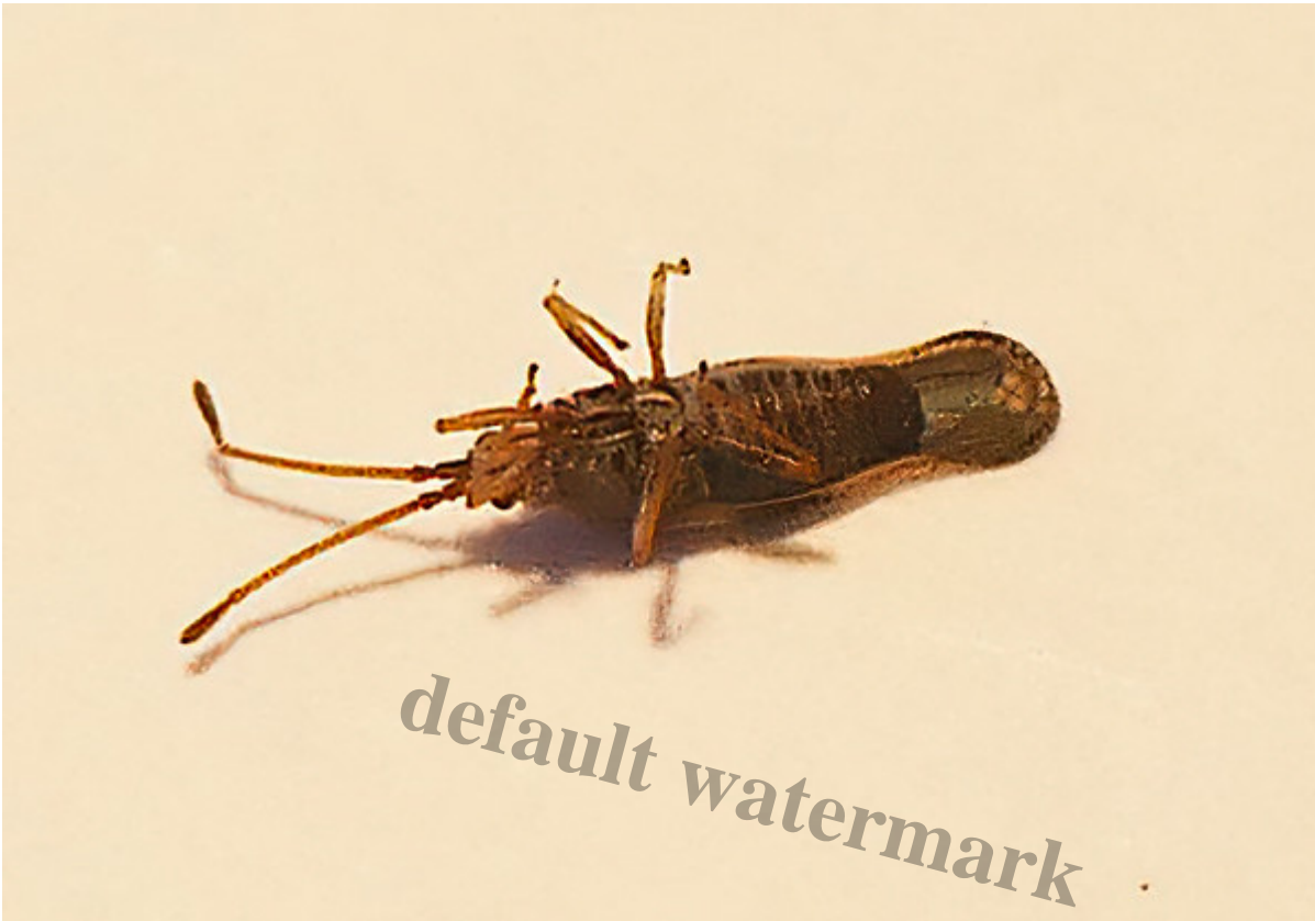
Olive Leaf Lace Bug ventral view (above)