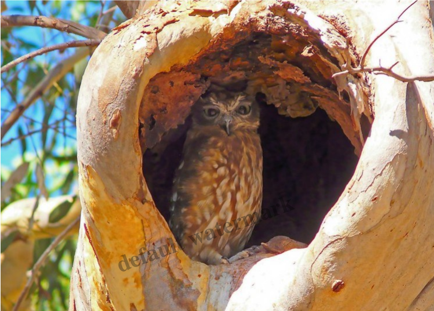
Southern Boobook (Ninox boobook) roosting in tree hollow

Ranger's Report – Brian Pritchard Pig monitoring and trapping is continuing in Mt. Pilot with smaller numbers being found. Some minor repair works have commenced on our flood damaged roads, but we are still waiting for confirmation of insurance funding. Several roads have had overhanging vegetation removed.