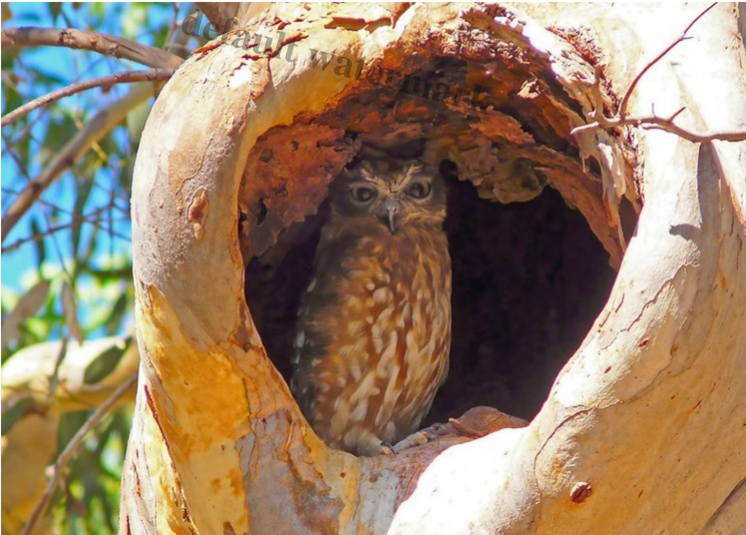
Southern Boobook (Ninox boobook) roosting in tree hollow

Southern Boobook owls (Ninox boobook) are permanent territorial residents in dry heathy forest throughout Chiltern-Mt Pilot National Park. They hunt at night for small vertebrates, invertebrates and flying insects. This owl was photographed in the western sector of Chiltern-Mt Pilot National park during an afternoon walk in February 2019. Large tree hollows are uncommon in this area of the Park, as about a century ago timber was heavily harvested to provide energy for the Eldorado dredge and township. The old-growth eucalypt in the photo is a Blakely's Gum (Eucalyptus blakelyi). Roosting owls aren't often noticed, as they are well camouflaged in the dimly lit interior of tree hollows.