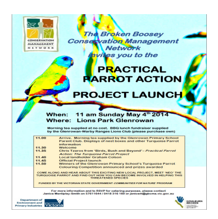
Turquoise Parrot Project