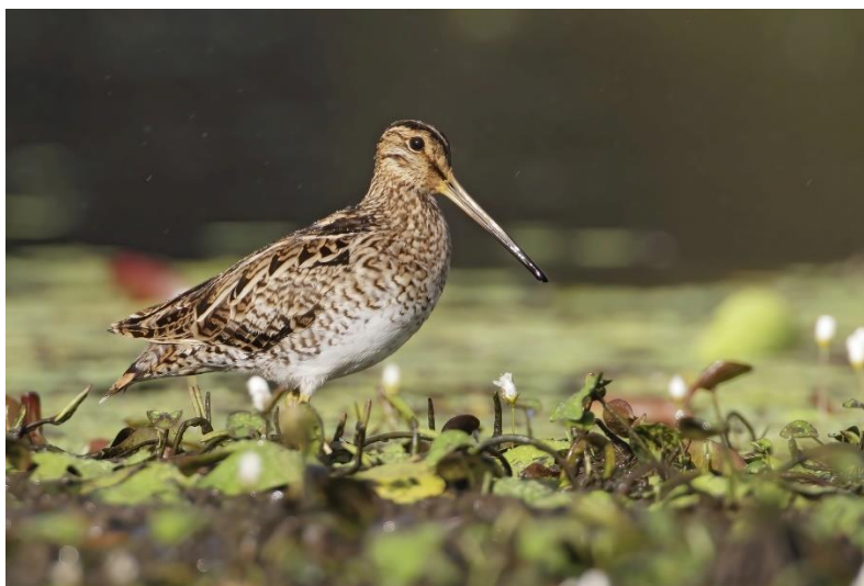
Latham's Snipe ( Gallinago hardwickii ).

These birds are international travellers that spend the months September through to April in our part of the world. Breeding takes place in the area around Northern Japan. Migrating such large distances makes these birds very strongly fliers. Their plumage enables them to blend in to the wetlands that they inhabit. Recent sightings have taken place at Wonga Wetlands in Albury and Tabletop. They can be expected to be found at Barambogie Dam, Chiltern Valley No 1 Dam and the nearby wetlands near the junction of Wenkes Road and Pit Road.