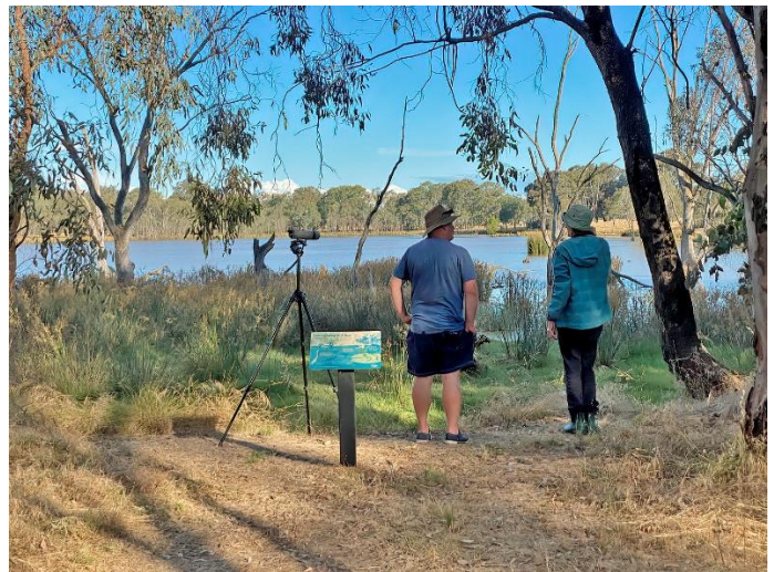
Friends December gathering at Chiltern Valley No 2 Dam.