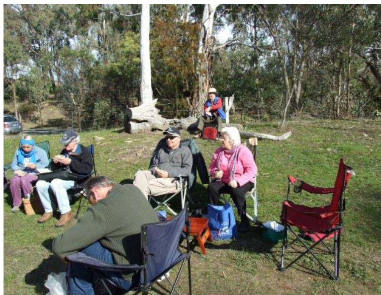
Our illustrious leader keeping an eye on us over lunch!