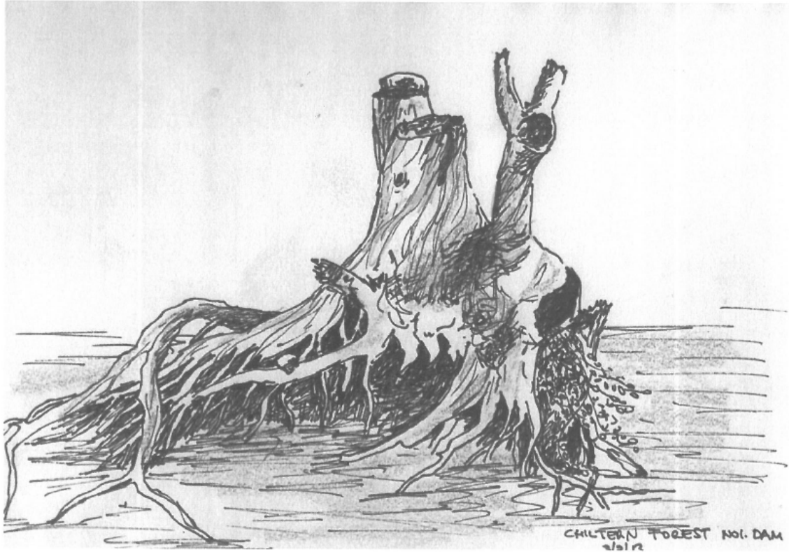
'An Old Stump', Stephanie Jakovac. No 1 Dam

It was a perfect April day for a stroll through the Cotton Creek area of Mt Granya SP. The skinks and male common brown butterflies clearly thought so too, and were extremely active. Although Phillip's bird list of 22 expanded by only 4 at the fire tower, it seemed that we were provided with a 'viewing' tree at the end of the day. Over a cuppa', yellow robins, a golden whistler & brown thornbill kept us entertained until the trip home.