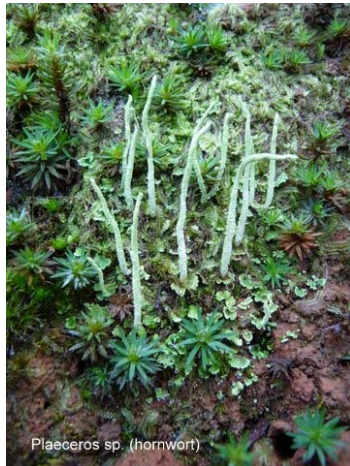
Plaeceros sp (Hornwort)

Later, at Lockhart's Gap, some were identifying trees, whilst others were focussed a little closer to the ground.