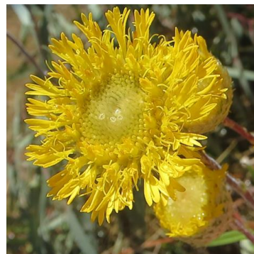
...and up close.

We retreated home a little cold and wet but well satisfied with all that we had seen.