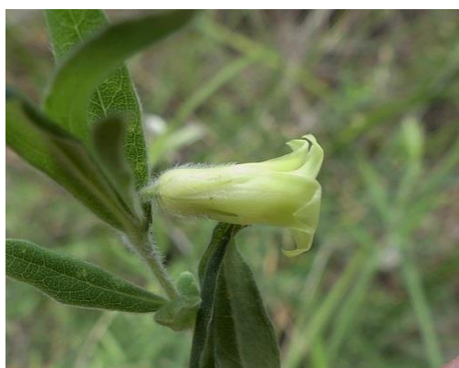
Common Apple-berry flower (N Blair)

Our first stop was at the junction of Mt Stanley Rd and Circular Creek Rd in a tall, montane forest of Narrow-leaved Peppermint ( Eucalyptus radiata ), Manna (Ribbon) Gum ( E. viminalis ), Candlebark ( E. rubida ) and Victorian Blue-gum/Eurabbie ( E. globulus subsp. bicostata ) with an understory of Common Cassinia ( Cassinia aculeata ), Silver Wattle ( Acacia dealbata ) and Bracken ( Pteridium esculentum ). Colour was provided by the Grey Guinea-flower ( Hibbertia obtusifolia ), Twining Glycine ( Glycine clandestina ), late Ivy-leaved Violets ( Viola hederacea ), flowering Hazel Pomaderris ( Pomaderris aspera ) and a single Common Apple-berry flower ( Billardiera scandens ). A pair of Black-faced Cuckoo-shrikes feeding two nestlings and a pair of Grey Fantails busy nest building were observed. (see cover page)