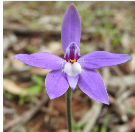
Waxlip Orchid ( Glossodia major )