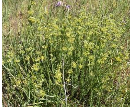
Curved Rice-flower (N Blair)