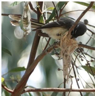
Grey Fantail, Stanley (P Seely)