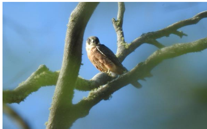
Australian Hobby