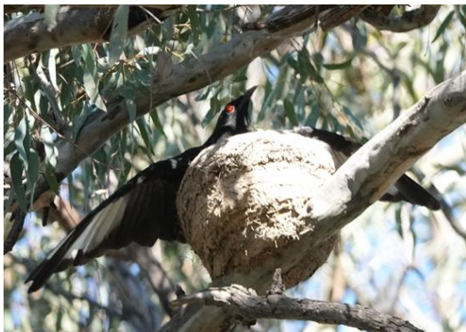
Chough, Chiltern Mt Pilot NP (P Spencer)