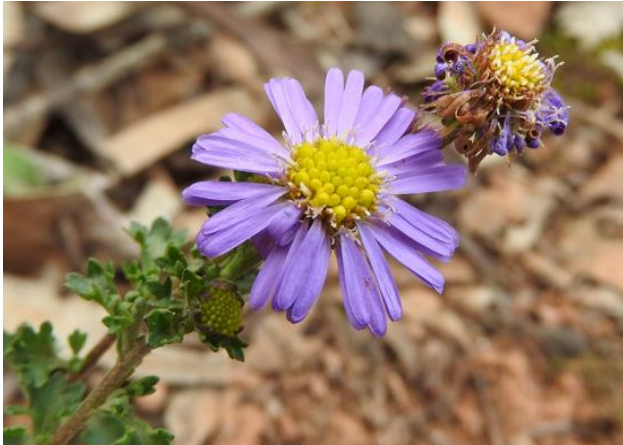
Blue-burr Daisy ( Calotis cuneifolia )

Phillip has provided a photographic selection of unidentified Eremophila and Grevillea species, along with other flora sighted on the day. The bird list for the day totaled 30 & was a compilation of Bernie's and Phillip's data.