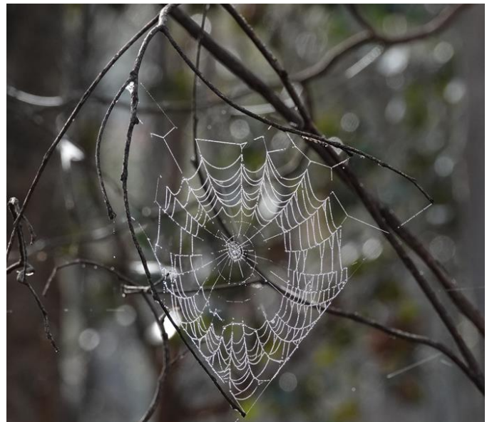
Dew laden spider web