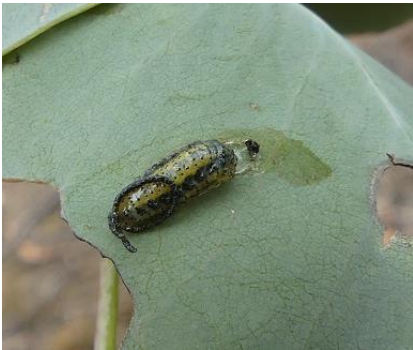
Eucalyptus Weevil larvae (N Blair)

Amongst the myriad of other things going on, Eucalyptus Weevil larvae were munching their way through the leaves, a small unidentified Cicada had climbed a twig stump and was warming in the sun whilst a Bee Fly sunbaked on some bare ground.