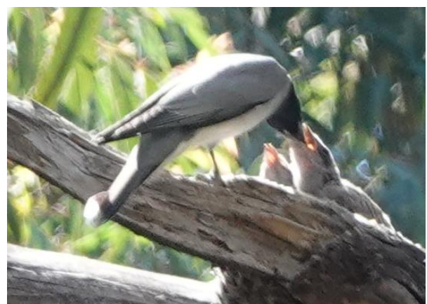
Black-faced Cuckoo Shrike with young (P Spencer)

Lunch was had at Lake Kerford on which were Grey Teal and Black Ducks, both with young, along with the usual Coots and Cormorants. Mountain Swamp-gums ( Eucalyptus camphora subsp. humeana ) were a new tree in the tall forest and in the understory some colour was provided by flowering Hop Bitter-pea ( Daviesia latifolia ), Mountain Mirbelia ( Mirbelia oxylobioides ) and Mountain Clematis ( Clematis aristata ). A patch of Common Bird-orchids ( Chiloglottis valida ) was noted along with two water ferns, Soft Water-fern ( Blechnum minus ) and Fishbone Water-fern ( Blechnum nudum ). A Black Swamp Wallaby crossed our path and an Australian Hobby was observed eating its prey high in a tree.