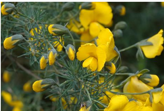
Common Wedge-pea

In the morning we walked along the Hume and Hovell track between Tunnel Rd and Tin Mines Track, had lunch at Samuel Bollards Campground and spent the afternoon looking west along Hanel's Road.