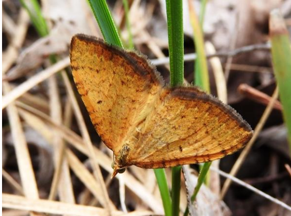
Some handsome (hope they are males?) unidentified moths (P Seely)