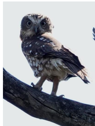
Boobook Owl & spectators