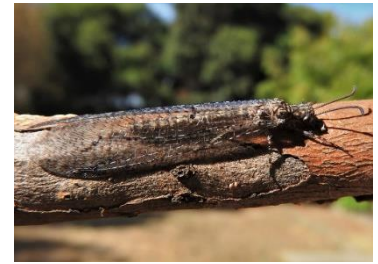
Adult Antlion (P Seely)

The adult antlion belongs to one of the Lacewing families, Myrmeleontidae, with its beautiful 'lace' wings captured locally in a photo by Phillip Seely. It too is a predator.