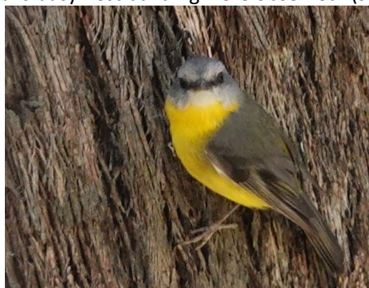
Yellow Robin

A second stop was made towards the Myrtleford Rd end of Circular Creek Rd. In a clearing dominated by the tussock grass, Red-anther Wallaby-grass ( Rytidosperma pallidum ), there was a lot more flowering with Tiger Orchids ( Diuris sulphurea ), Cinnamon Bells ( Gastrodia sesamoides ) and the early stalks of Rosy Hyacinth-orchids ( Dipodium roseum ) along with Button Everlastings ( Coronidium scorpioides ), Austral Stork's-bill ( Pelargonium australe ), Tall Daisies ( Brachyscome diversifolia ), Weak Daisies ( Brachyscome ptychocarpa ), Creamy Candles ( Stackhousia monogyne ) and Milkmaids ( Burchardia umbellata ). Entertainment was provided by a busy echidna who walked nonchalantly around us.