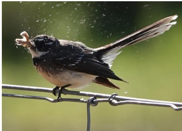
Grey Fantail (P Spencer)