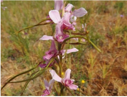
Purple Diuris (P Seely)