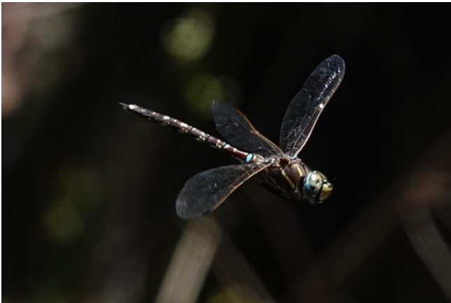
Unidentified Dragonfly (P Spencer)