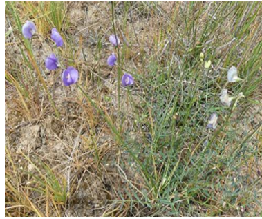
Broughton Pea and Seedpods (enlarged) (N Blair)