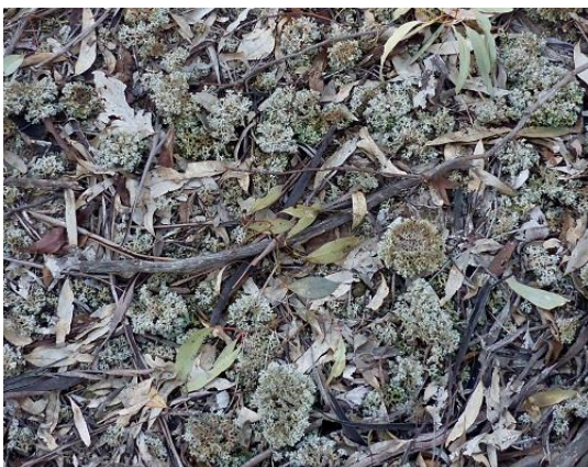
Coral Lichen (N Blair)

We went into a section of the Park between Pooley's Track and Ballarat Rd in the optimistic hope of spotting a Regent Honeyeater. The Red Ironbarks ( Eucalyptus sideroxylon ) had patchy blossom and Little Lorikeets, along with 4 species of Honeyeaters, were seen; but no Regents. It was noted that the White ( E. albens ) and Red ( E. polyanthemos subsp. vestita ) Boxes were healthy and budding but the