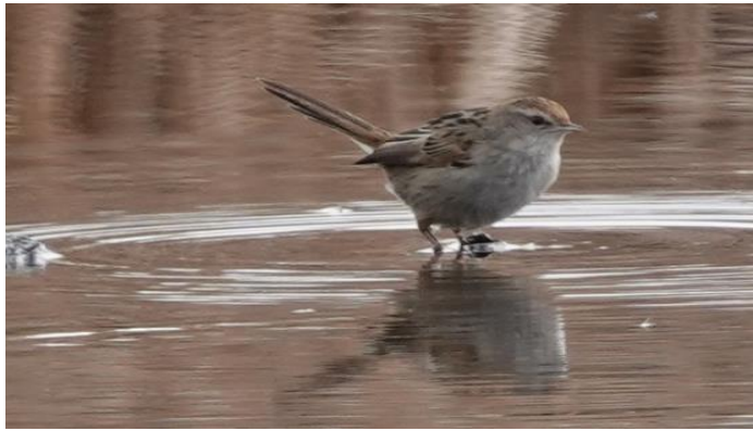
Little Grassbird (P Spencer)