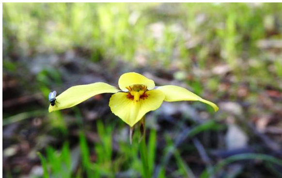
Golden Moth

We started in the Pilot section at the junction of Elligates Rd and Baynes Gully Rd. Yellow was the