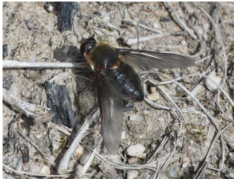
Bee Fly (N Blair)