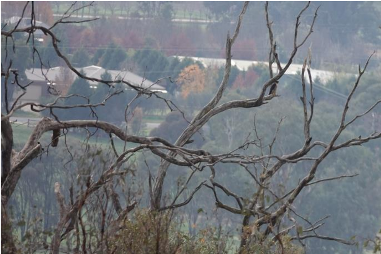
View from 9 Mile Hill - spot the Peregrine... (P Seely)