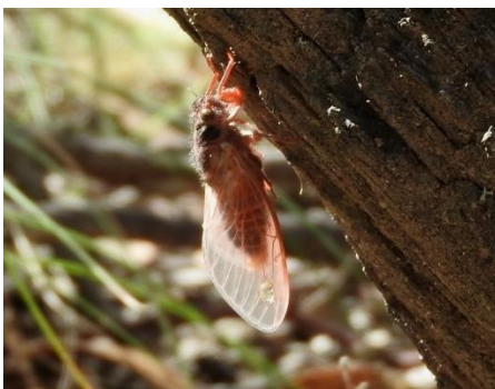
unidentified Cicada (P Seely)