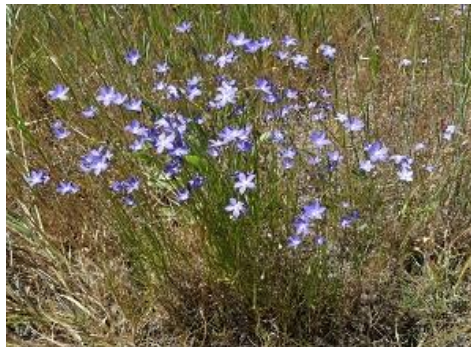
River Bluebells (N Blair)