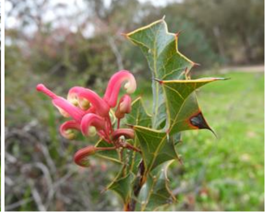
More stunning flowers, this time Erimophila species