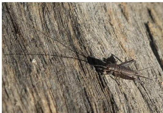
Mottled Bush Cricket nymph (N Blair)

After lunch we moved to Chiltern Valley 2 Dam. A flock of 50 – 100 Pink-eared Ducks dominated the water and a male Chestnut Teal in full breeding plumage was seen. The Welcome Swallows were plentiful and very active and swarms of ‘gnats’ were apparent in the rays of sunlight.