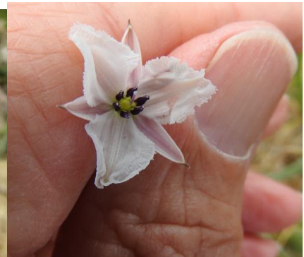
(whitest variant too blurry to include)

Small Chocolate Lily and pale forms - ranging from purple, to white-edged, to almost pure white;