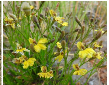
Slender Goodenia (P Seely)