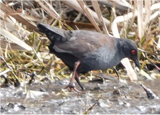
Spotless Crake (P Spencer)