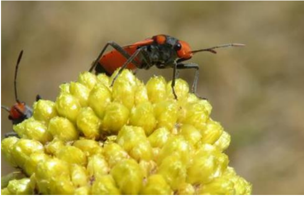
Swamp Billy Button & Mirid Bugs