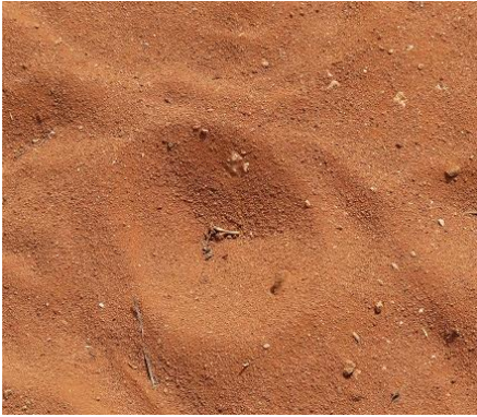
Antlion pit & larva, Central Australia (N Blair)