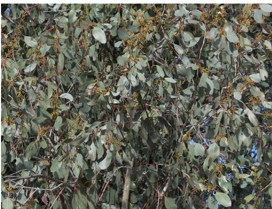
Mountain Swamp-gum (N Blair)

Lunch was had at Lake Kerford on which were Grey Teal and Black Ducks, both with young, along with the usual Coots and Cormorants. Mountain Swamp-gums ( Eucalyptus camphora subsp. humeana ) were a new tree in the tall forest and in the understory some colour was provided by flowering Hop Bitter-pea ( Daviesia latifolia ), Mountain Mirbelia ( Mirbelia oxylobioides ) and Mountain Clematis ( Clematis aristata ). A patch of Common Bird-orchids ( Chiloglottis valida ) was noted along with two water ferns, Soft Water-fern ( Blechnum minus ) and Fishbone Water-fern ( Blechnum nudum ). A Black Swamp Wallaby crossed our path and an Australian Hobby was observed eating its prey high in a tree.