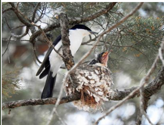
Restless Flycatcher, Kentucky (P Seely)