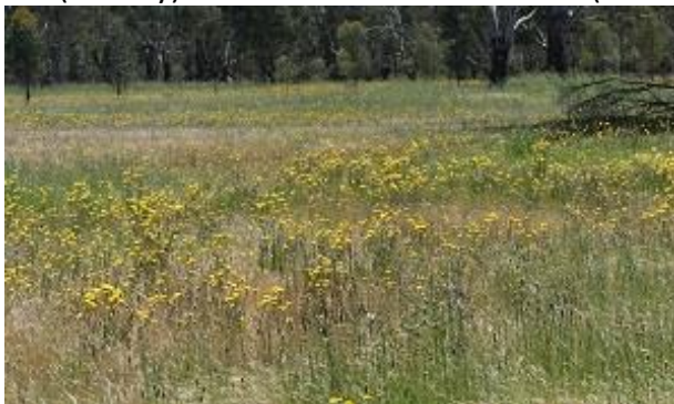
A massed display of Showy Podolepis (N Blair)