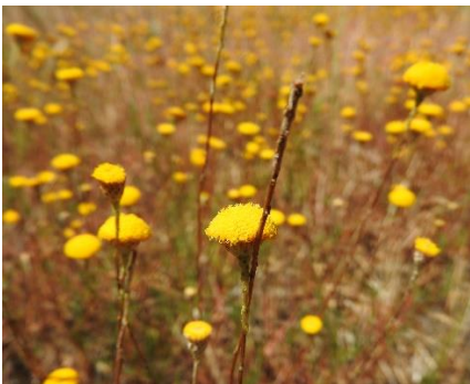
Scaly Buttons (P Seely)

After lunch we visited the Wangaratta Common. The visit was cut short by a hail storm but not before we had time to walk into the Common and look at the spectacular display of flowering Showy Podolepis ( Podolepis jaceoides ) and Scaly Buttons ( Leptorhynchos squamatus ). The massed River Bluebells ( Wahlenbergia fluminalis ) had largely closed their flowers against the elements but there were nice groups of flowering Blushing Bindweed ( Convolvulus erubescens ), Slender Goodenia ( Goodenia gracilis ) and one patch of flowering Woodland Daisies ( Brachyscome paludicola ).