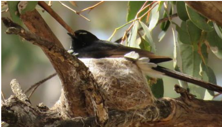
Willie Wagtail, Kentucky