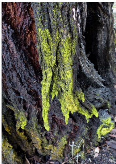
Gold Dust Lichen (N Blair)

We moved to Honeyeater Picnic Area for lunch and on the way noted the many ghost fungi and a patch of Striated Greenhoods ( Pterostylis striata ) in full flower with the bark of an Ironbark covered in Gold Dust Lichen ( Chrysothrix candelaris ). At the Picnic Area more fungi were found on and around the dead logs, along with the pupal cases of the Ghost (Rain) Moth and a tiny Mottled Bush Cricket nymph ( Eurepa marginipennis ).