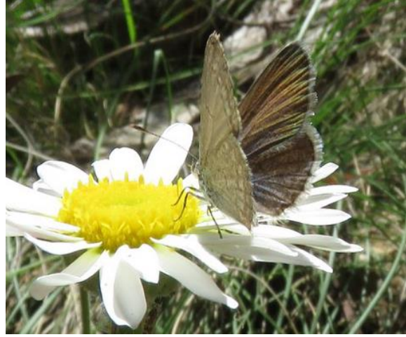
Common Grass Blue, female (R Andrews)