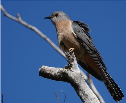
Fan-tailed Cuckoo (P Spencer)