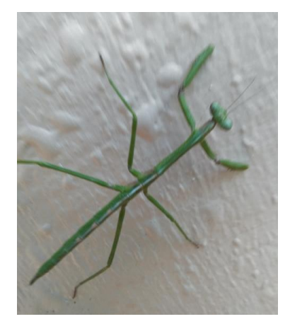
Mantid visitor