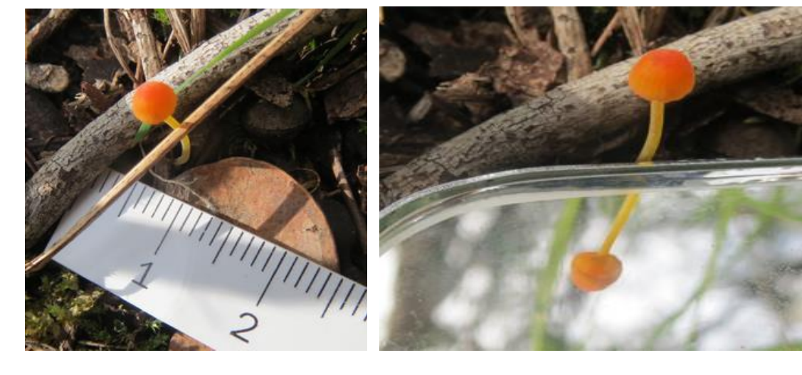
Unidentified, very small gilled mushroom (Mycena sp?).

AWFN Newsletter Page 9 of 12 No. 139 June 2020