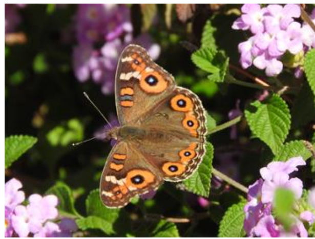
Meadow Argus (Junonia orithya)