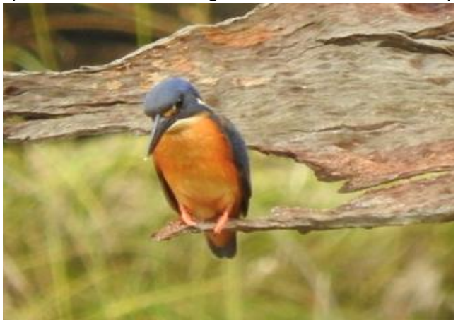
Azure Kingfisher (P Seely)

9 members attended this outing in Wangaratta in pleasant autumn weather. The morning was spent at Mullinmur wetlands beside the Ovens River at the northern end of Phillipson Street. These wetlands have undergone major works and revegetation and are the site of ongoing work including scientific studies. We were greeted by an outbreak of Radar Beetles ( Rhipicera femorata ) which are truly spectacular on close-up and the birdlife was plentiful with Azure Kingfishers and Brown Treecreepers amongst the notables.