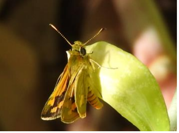
Greenish Grass-dart (Ocybadistes walkeri)

AWFN Newsletter Page 6 of 12 No. 139 June 2020