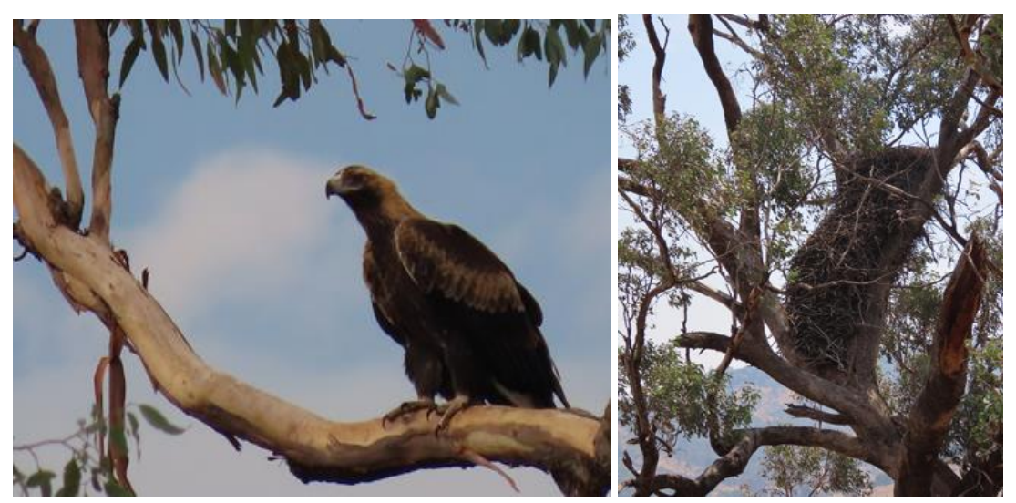
Wedge-Tailed Eagle and its nest with Table Top in the background. The nest has been added to incrementally, building upwards over many years – an amazing structure

Our wonderful autumn weather plus the time to look has triggered much member activity. Thank you to everyone for these photos & information.