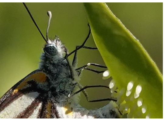
Caper White Butterfly and close up of newly laid eggs (P Spencer). [Perhaps not clear here but the eggs can be seen as fluted in the original photo]