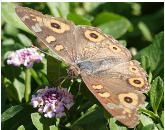
Meadow Argus sipping nectar