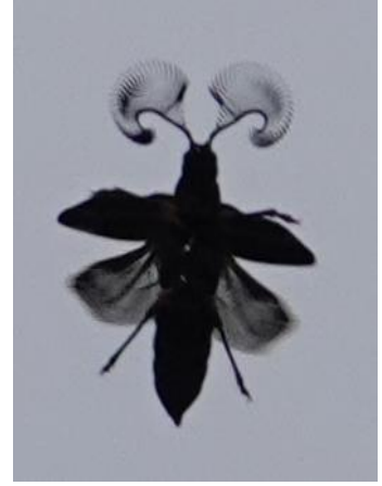
Radar Beetle in flight

The wetlands are a River Red-gum ( Eucalyptus camaldulensis ) floodplain with an understorey of Silver Wattle ( Acacia dealbata ) with the revegetation program re-introducing many shrubs including Blackwood ( A. melanoxylon ), Golden Wattle ( A. pycnantha ), Rough-barked Honey-Myrtle ( Melaleuca parvistaminea ), River Teatree ( Callistemon sieberi ) and Sweet Bursaria ( Bursaria spinosa subsp. spinosa ). No mammals were sighted but reptiles such as a long-necked river turtle and a Yellow-bellied Water Skink were seen and, in the insect group, along with the above beetles, Acacia-horned Treehoppers ( Sextilius virescens ) 5mm long were found on a Silver Wattle.