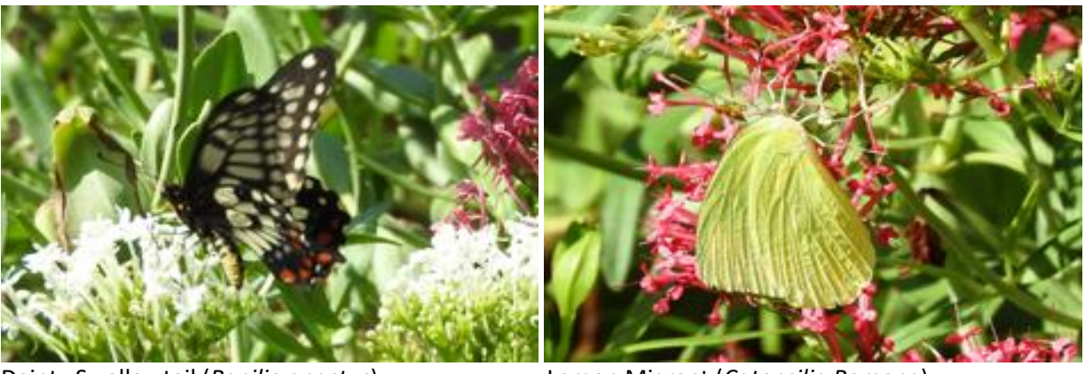
Dainty Swallowtail (Papilio anactus)