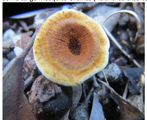
Fairy Stool mushroom (Coltricia cinnamomea) Growing on underground wood & showing the radial surface hairs

This unscheduled Autumn outing was arranged for us at short notice by Veronica – I think she even chose the weather. The morning was spent around Honeyeater Picnic Ground. A few gilled fungi were seen but they were mainly on their way out or had been pulled out of the ground. Some orchids such as the Inland Red-tip Greenhood ( Pterostylis rubescens ) were finished (or eaten) but we spotted good specimens of the Large Autumn Greenhood ( Pterostylis sp aff revoluta ), Striped Greenhoods ( P. striata ) – see cover photo by P Spencer - and some Large Mosquito Orchids ( Acianthus exsertus ).