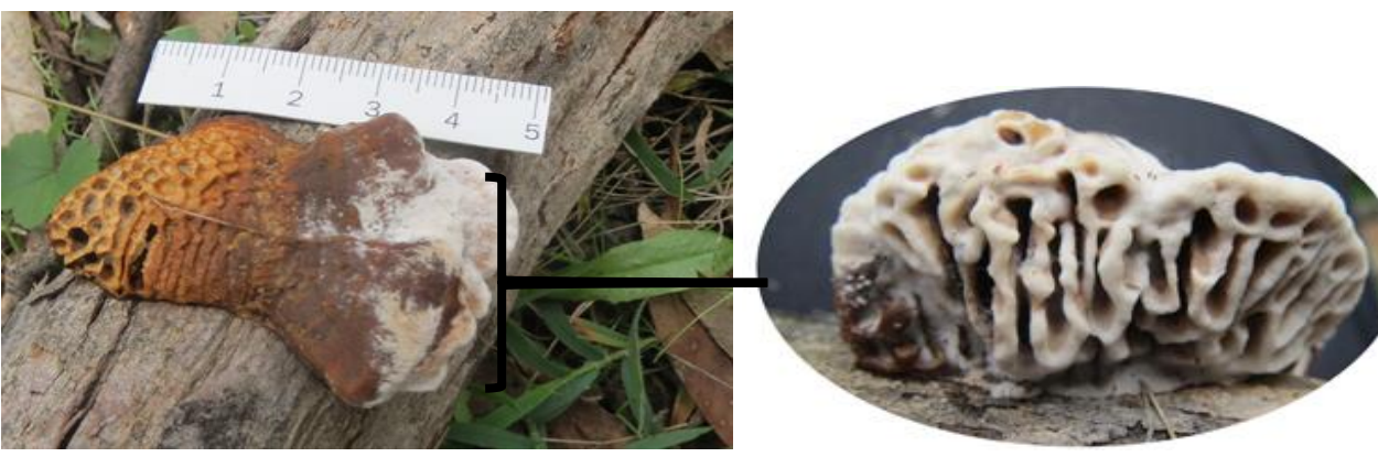
Mazegills (Hexagonia vesparia) – a woody, pore-forming fungus saprophytic on dead & dying Eucalypts