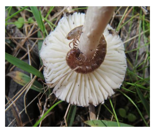
Unidentified Polydesmid Millipede - Mt Granya NP (G Steed)