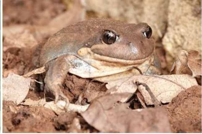
'Disturbed' Eastern Banjo Frog (P Spencer) [so not all fauna has had a quieter life in Lockdown?]