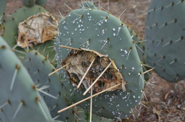
Wheel cactus invaded by beetles April 2020

Mick Webster, for Friends of Chiltern Mt Pilot National Park.