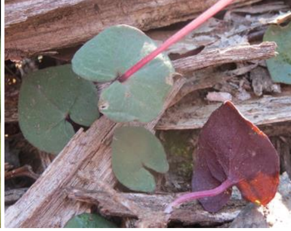
Large Mosquito Orchid (P Spencer), with close-up of heart-shaped leaf and purplish underside

Birds were heard but not too many showed themselves for photographs. However the very handsome Yellowtufted Honeyeaters ( Lichenostomus melanops ) seemed to be everywhere.