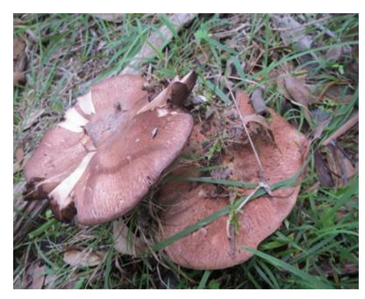
Agaricus sp (austrovinaceus?)