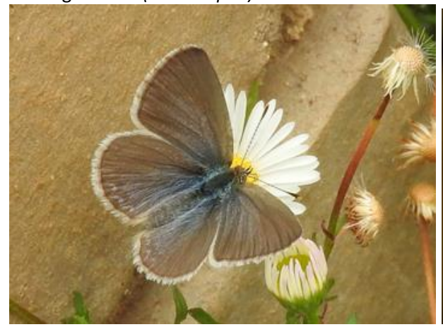
Common Grass-blue (Zizina labridus)