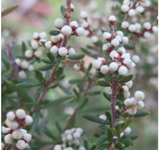
Bitter Cryptandra (buds)

I decided to head back down Riley's Rd to photograph the budding Bitter Cryptandra (C. amara). En-route I was lucky enough to be watching a small group of White-browed Babblers (Pomatostomus supercillosus) cavorting about, when a Yellow-footed Antichinus (A. flavipes) appeared on the stump behind them; a lovely end to an enjoyable day - thank you Veronica.