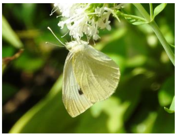
Cabbage White (Pieris rapae)