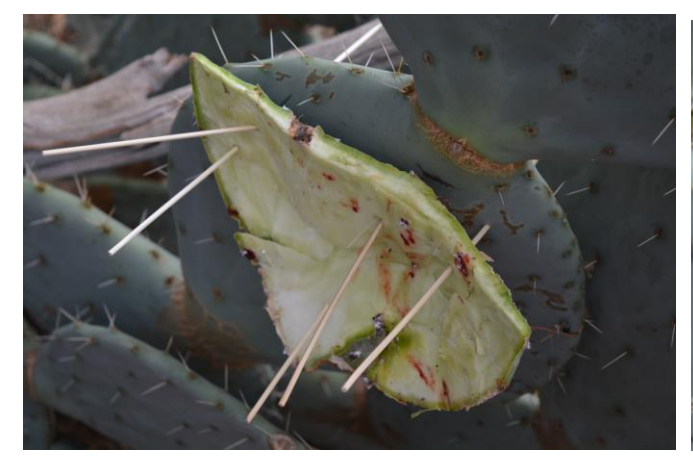
Prickly Pear with Cochineal Beetles inside (white fluff)