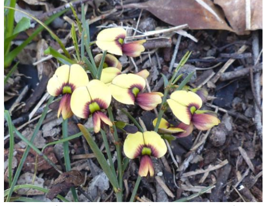
Leafy Templetonia (T. stenophylla)

We completed the day at Redlands Hill, particularly noting peas and wattles (see list page 4). Of interest was the Leafy Templetonia (T. stenophylla) which was not recorded on either the reserve's species list or the Plants of Western NSW. [Corowa Land Care have been advised]