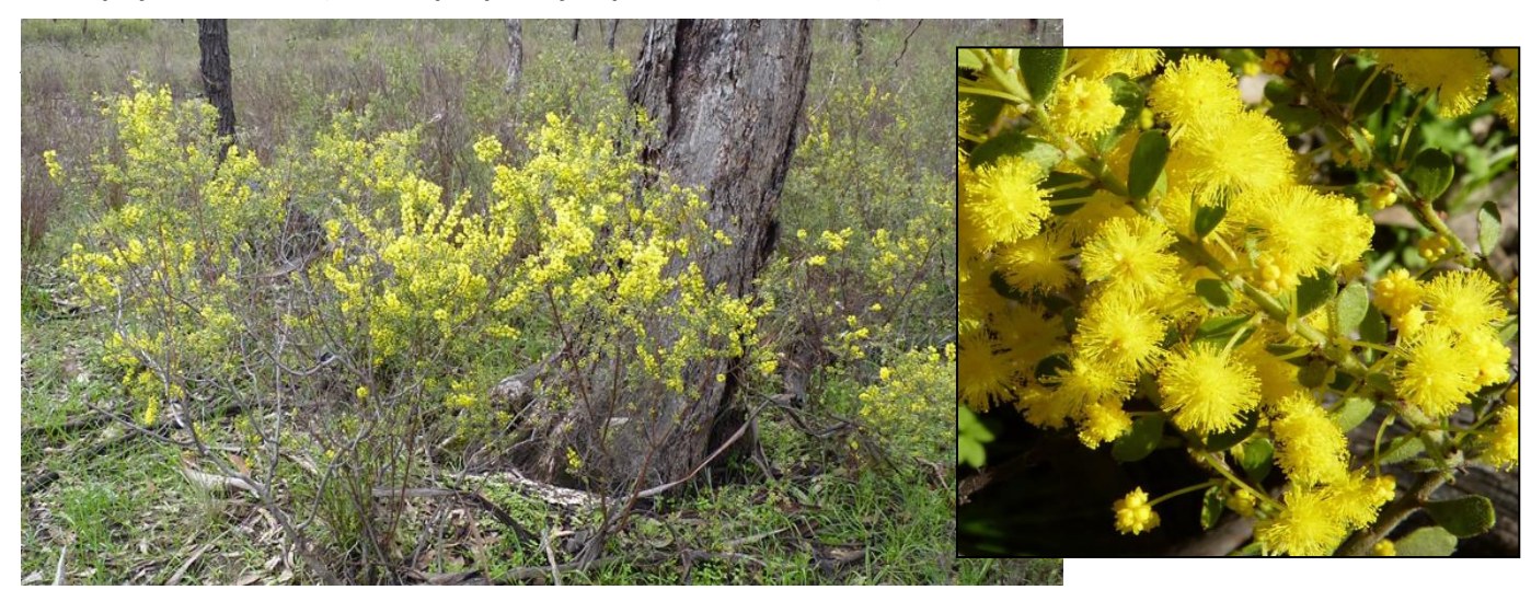
Acacia acinaceae (Gold-dust Wattle)

AWFN Newsletter Page 2 of 12 No. 123 October 2015