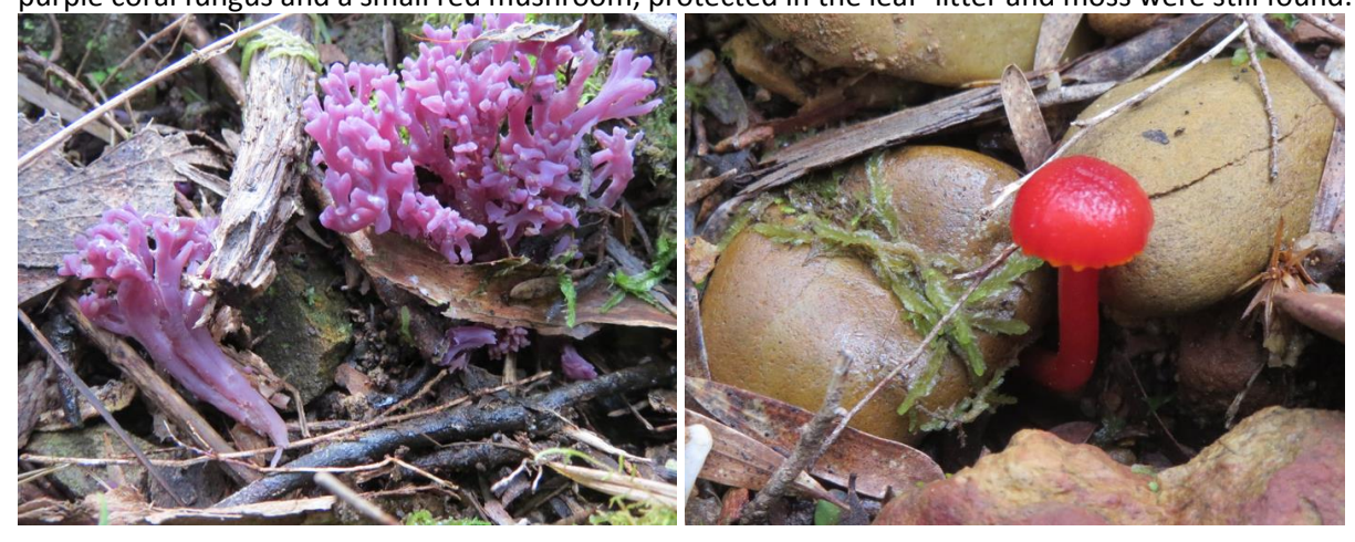
Coral fungus (Ramaria versatilus?)

The leading group were lucky enough to surprise a Lyrebird, which may have been responsible for the "Whipbird" call heard earlier. Fungi were less abundant than last time but the tougher polypores, a purple coral fungus and a small red mushroom, protected in the leaf—litter and moss were still found.