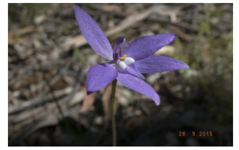
Waxlips