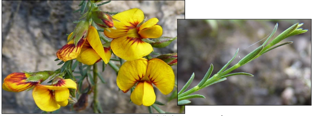
Eutaxia microphylla (Common Eutaxia)