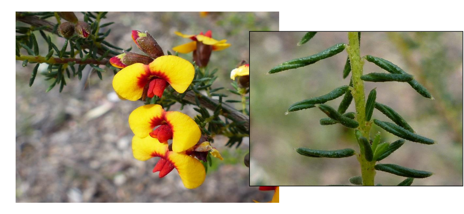
Dilwynia phylicoides (Small-leaf Parrot Pea)

A second talk was held at the Wonga Wetlands facility on the 9<sup>th</sup> September, this time looking at a list of 52 local species in the Fabaceae family. Photos of the habit, leaf, flower and pod of each species were viewed with emphasis on the features that distinguish both the 26 genera and the 52 species listed. On the following outings 17 species were identified (see Table 1, Page 4).