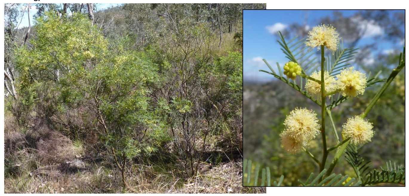
Acacia deanei sub-species paucijuga (Deane's Wattle)