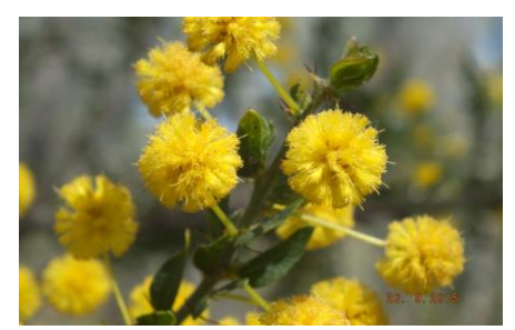
Hedge wattle

We had two stops along Rileys Road which is at the northern end of the park where on arrival we noticed the park was alive with drifts of yellow and gold. The wattles were in splendid colour although September has been dry and the park is drying out fast. We saw amongst others: Sticky Everlasting - Xerochrysum viscosum ; Hop Bitter Pea - Daviesia latifolia ; Yam Daisy - Microseris lanceolata ; Golden Wattle - Acacia pycnantha ; Gold Dust Wattle - Acacia acinacea ; Hedge Wattle - Acacia paradoxa ; Mountain Grevillea - Grevillea alpina ; Austral Indigo - Indigofera australis ; Donkey Orchid, Leopard Orchid - Diuris pardina ; Hoary Guinea Flower - Hibbertia obtusifolia ; Common Fringe Lily - Thysanotus tuberosus ; Bulbine Lily - Bulbine bulbosa ; Purple Coral Pea - Hardenbergia violacea ; Pink Fingers Caladenia - Petalochilus fuscatus ; Common Beard Heath - Leucopogon virgatus ; Daphne Heath - Brachyloma daphnoides ; Digger's Speedwell - Derwentia perfoliata ; Cotton Fireweed - Senecio quadridentatus ; Cherry Ballart - Exocarpos cupressiformis ; Wax Lip Orchid - Glossedia major .