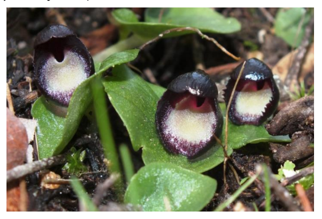
Helmet orchid (Corybas incurvus)