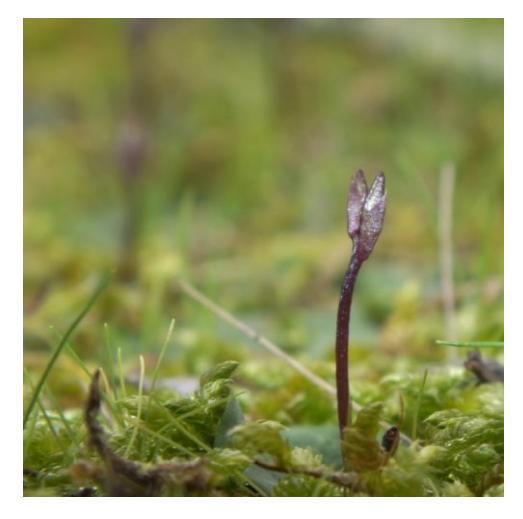
Gnat orchid bud (Cyrtostylis reniformis)