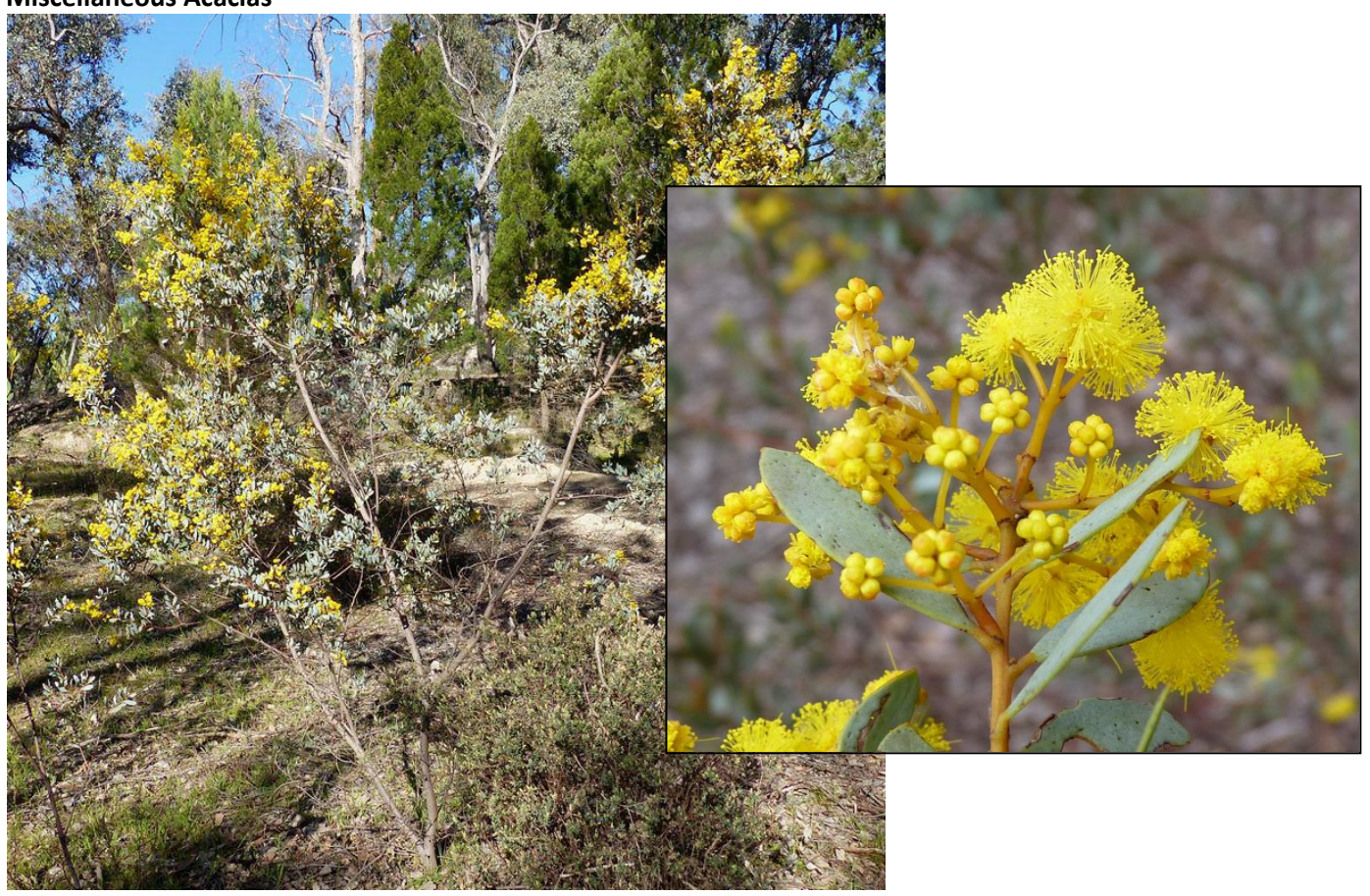
Acacia buxifolia (Box-leaf Wattle)