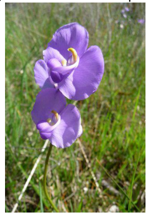
Broughton Pea (Swainsonia procumbens)

Other sightings on the way to Redlands Hill were Swainsonia, Eutaxia and a very handsome group of Whistling Ducks on a roadside pond – a brilliantly organised route!