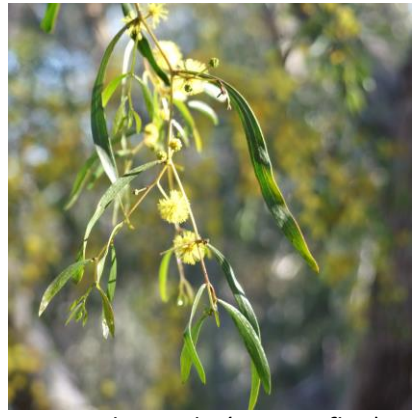
Varnish Wattle (A vernicflua)

AWFN Newsletter Page 8 of 12 No. 123 October 2015