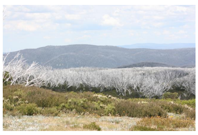
Dead snow gums following the bushfires