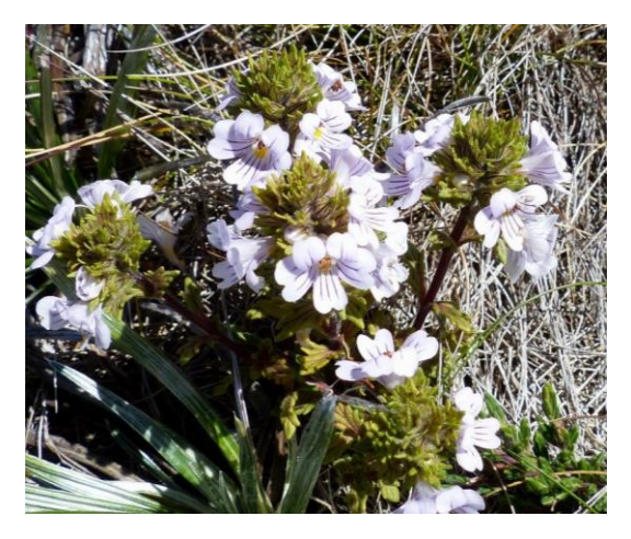
Bogong Eyebright - Euphrasia eichleri