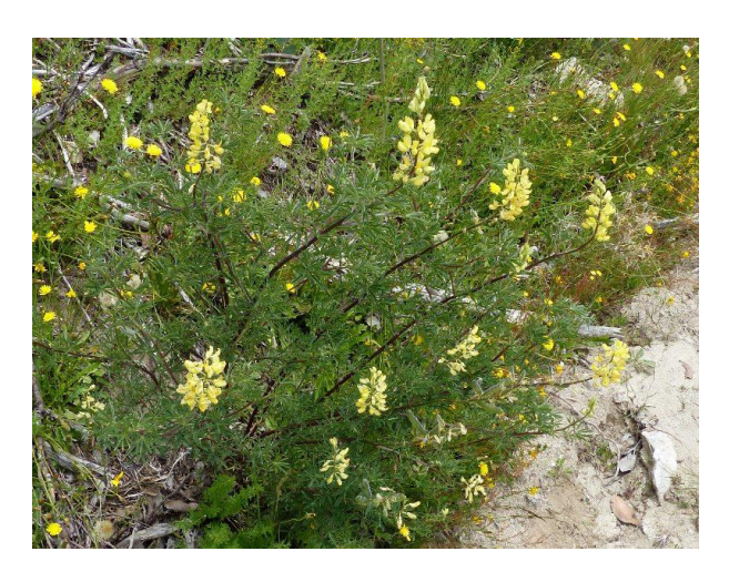
Lupin sp. - Lupinus polyphyllus