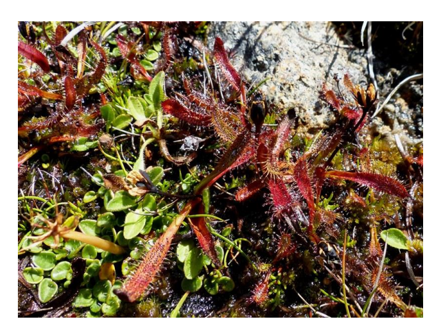
Alpine Sundew - Drosera arcturi