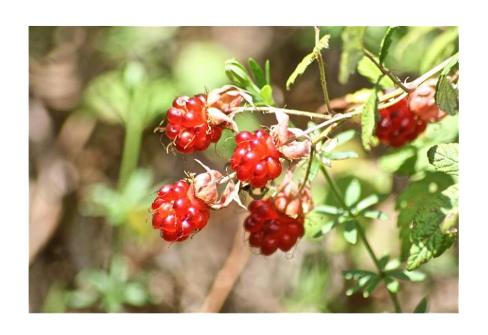
Native Raspberry - Rubus parvifolius