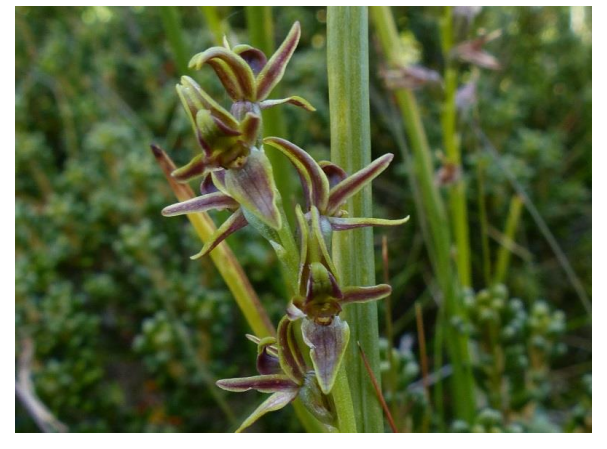
Alpine Leek -orchid - Prasophyllum tadgellianum