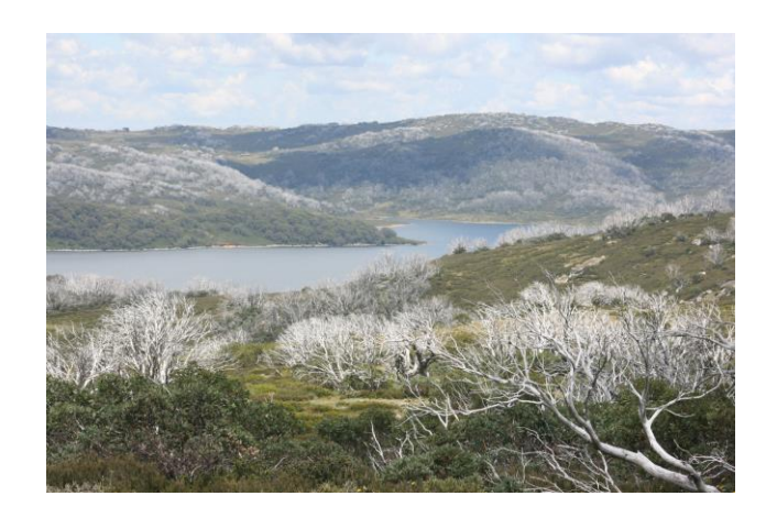
Rocky Valley Dam from Heathy Spur

These walks provided a great variety of spectacular views across the lakes and plateau as well as the surrounding Alps, 2 well-preserved Cattleman's Huts and a wonderful variety of alpine habitats. By the end of our outings we had identified more than 100 plant species that were flowering or fruiting. This was pleasing as this year we were a week or two later than previous trips.