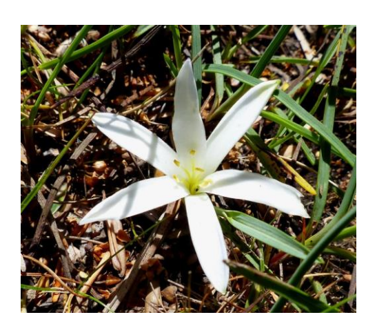
Sky Lily - Herpolirion novae-zelandiae