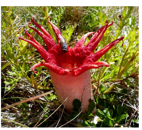
Star-fish Fungus - Aseroe rubra