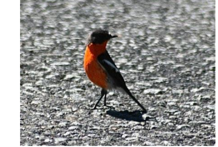
No. 120, MARCH 2015

Watch out for him in Winter; he generally comes visiting here at that time.