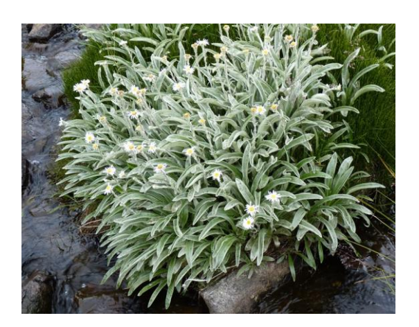
Silky Daisy - Celmisia sericophylla

All of the above, together with great food, drink and company, made for a most enjoyable and memorable excursion.