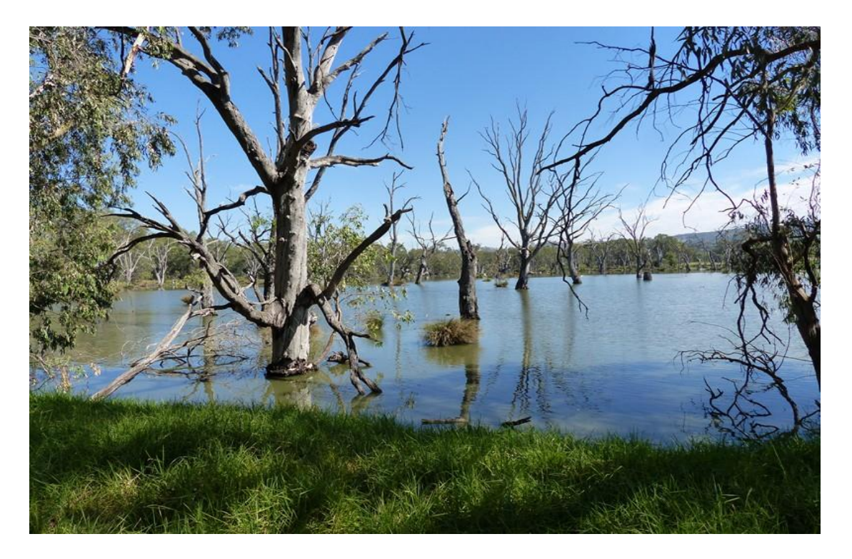
Wagirra Yindyamarra (Walk on the ground respectfully).

On a warm, overcast day 15 of us met for a morning meander along the Murray River and adjacent Albury City settling ponds. Heading west from the car park, pleasant vistas south across the river to a floodplain dotted with River Red Gums gained our interest.