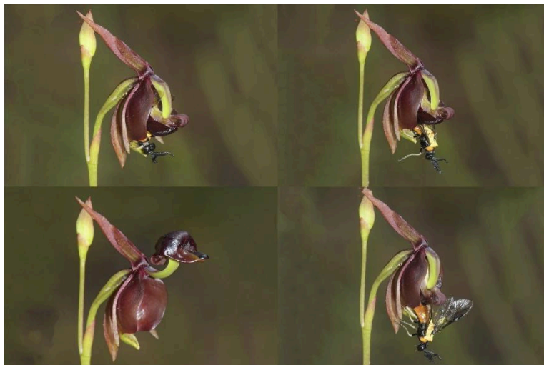
Large Duck-orchid pollination ( Caleana major ).

This species is flowering at the moment and you may be lucky enough to observe pollination in action.