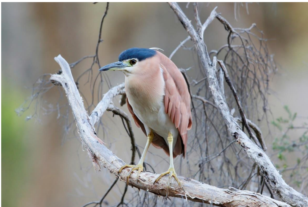
Nankeen Night-Heron ( Nycticorax caledonicus ).

Nankeen Night-Herons are a medium to large sized bird that inhabits reedbeds, intertidal flats, rivers, creeks, lakes and large ponds. They feed nocturnally and roost close to water by day. In the Park, they have been seen at Chiltern Valley No 1 and 2 Dams and are likely to be found at Barambogie Dam.