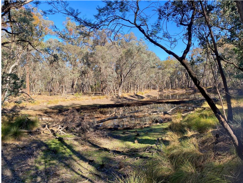
Cyanide Dam showing just two pools of water.

Morning tea took place at the Honeyeater Picnic Area where three species of robins were sighted (Scarlet, Eastern Yellow and Rose Robin). Despite some recent rain, the generally dry conditions were evidenced by the relatively low level of Cyanide Dam.