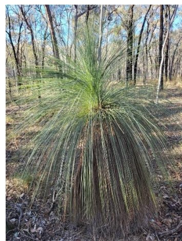
One of the signs in need of replacement and a Grey Grass-tree ( Xanthorrhoea glauca subsp. angustifolia ).