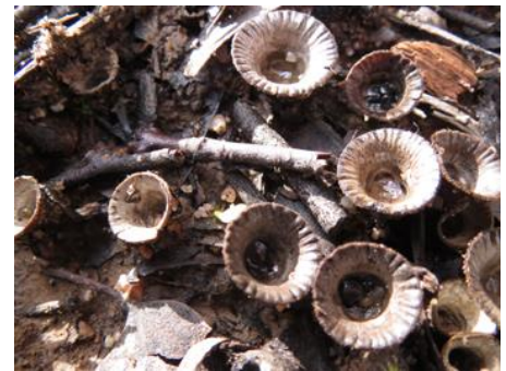
A Gasteromycete (puff ball fungus) – Cyathus stercoreus – ‘Bird's-nest fungus’ (N Blair)