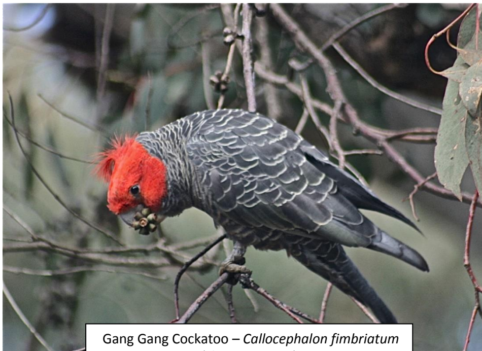
Gang Gang Cockatoo – Callocephalon fimbriatum