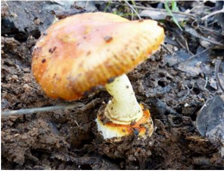
Gilled fungus: Amanita xanthocephala – ‘Pretty Grisette’. Note the cup (volva) at base (N Blair)