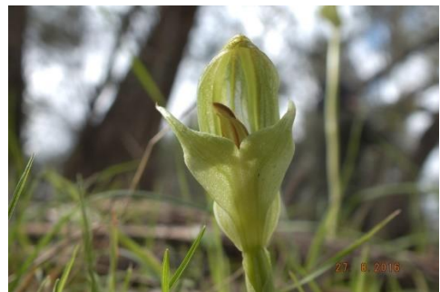
Blunt Greenhood, ( Pterostylis curta ) (P Spencer)