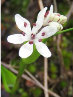
Early Nancy (bi-sexual flower)

Amongst the herbs were Pterostylis curta (Blunt Greenhood), Wurmbia dioica (Early Nancy), Cymbonotus preissianus (Austral Bear's Ears), Lomandra longifolia (Spiny-headed Mat-rush) and Cheilanthes austrotenuifolia (Green Rock-fern). Also noted was a delightful, red fungus ( Hygrocybe sp.). The area was enhanced by a dilapidated trestle bridge and a vigorously flowing stream.