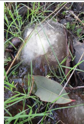
Unidentified ‘goo’ - (star jelly?) located on ground & branches of dying Kurrajong tree. Possibilities include regurgitated frogs eggs, crystal brain fungus, frog spawn, slime mould, or even something deposited during meteor showers! (G Steed)