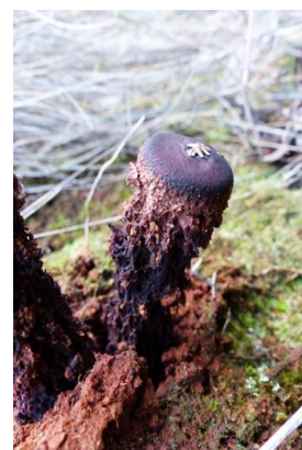
Common Pretty Mouth

Birds seen included Little Pied Cormorant, Intermediate Egret, Galahs, Hardhead Ducks, Coots, Corellas, Swallows, Superb Fairy-wren, and a very obliging Gang-gang Cockatoo (photo on page 1), as spotted by new member John