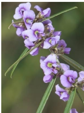
Hovea heterophylla – Common Hovea

Common Hovea and Hardengeria were beginning to flower and Scarlet Sundews were hoping for insects to find them.