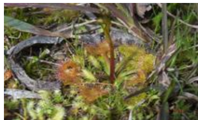
Drosera sp. – Sundew