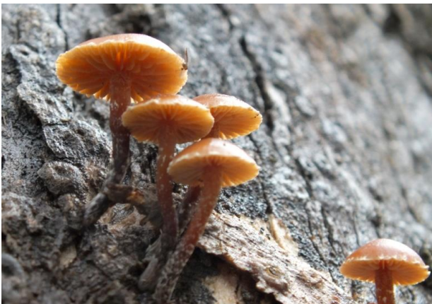
Gilled fungus: Hypholoma sp; purple black spores. Note the veil remnants as a ragged fringe on edge of cap