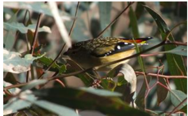
Male Spotted Pardalote – (P Spencer)