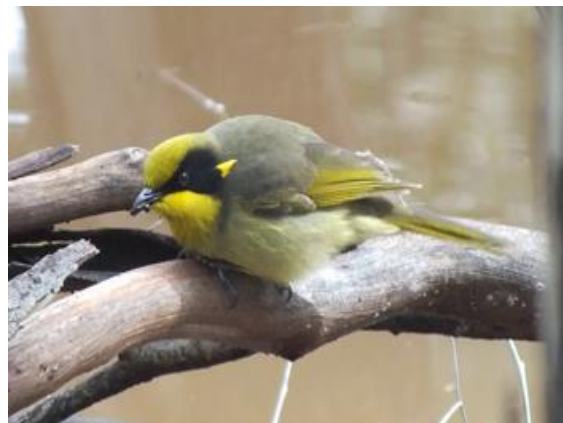
Yellow-tufted Honeyeater (P Spencer)

Here Neil identified the Hooded Mosquito Orchid ( Acianthus collinus ): ‘collinus’ meaning growing on a hill and not formally described until 1991. Members gradually retreated to warmer places during the day until only two completed the final leg in the late afternoon. Total bird count for the day was 36.