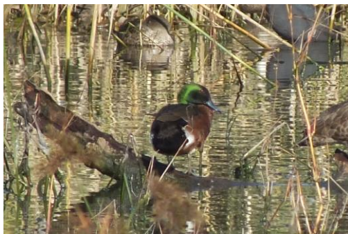
Male Chestnut Teal - (P Spencer)