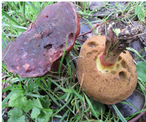
A fleshy pore fungus – possibly Boletus barragensis (G Steed)