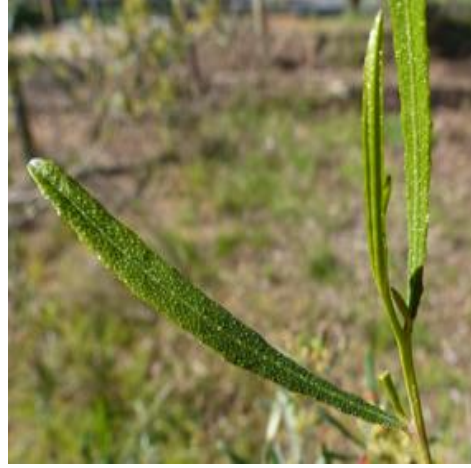
Dodonea viscosa subsp. angustissima , Slender Hop-Bush – Flowers & Leaves.

Amongst the herbs were Pterostylis curta (Blunt Greenhood), Wurmbia dioica (Early Nancy), Cymbonotus preissianus (Austral Bear's Ears), Lomandra longifolia (Spiny-headed Mat-rush) and Cheilanthes austrotenuifolia (Green Rock-fern). Also noted was a delightful, red fungus ( Hygrocybe sp.). The area was enhanced by a dilapidated trestle bridge and a vigorously flowing stream.