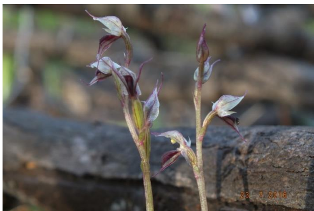
Hooded Mosquito Orchid