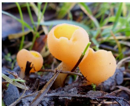
Stalked Orange Peel fungus – Sowerbyella rhenana