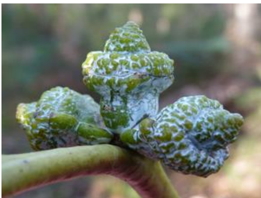
Sessile buds, in triplet, of Victorian Blue-Gum (N Blair)

The afternoon was spent going on the walking circuit around and over the summit. Unfortunately because of the wet, slippery rocks in one section not all members could fully participate on the walk through an overstorey of Eucalyptus globulus subsp. bicostata (Victorian Blue-gum) - identified by its buds in triplet – E. mannifera (Brittle Gum) and E. macrorhyncha (Red Stringybark); an understory Cassinia ozothamnoides (Cottony Cassinia), Dodonaea viscosa subsp. cuneata (Wedge-leaf Hop-bush), Platylobium montanum (Mountain Flat-pea), Cassinia aculeata (Common Cassinia) and Lomatia fraseri (Tree Lomatia). On the ground were noted Corybas incurvus (Slaty Helmut-orchid), Isotoma axillaris (Rock Isotome), Hovea heterophylla (Common Hovea). Also found was a white leathery shelf fungus yet to be identified.