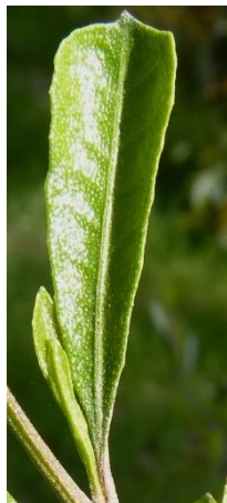
Leaf of aptly named Wedge-leaf Hop-bush (N Blair)