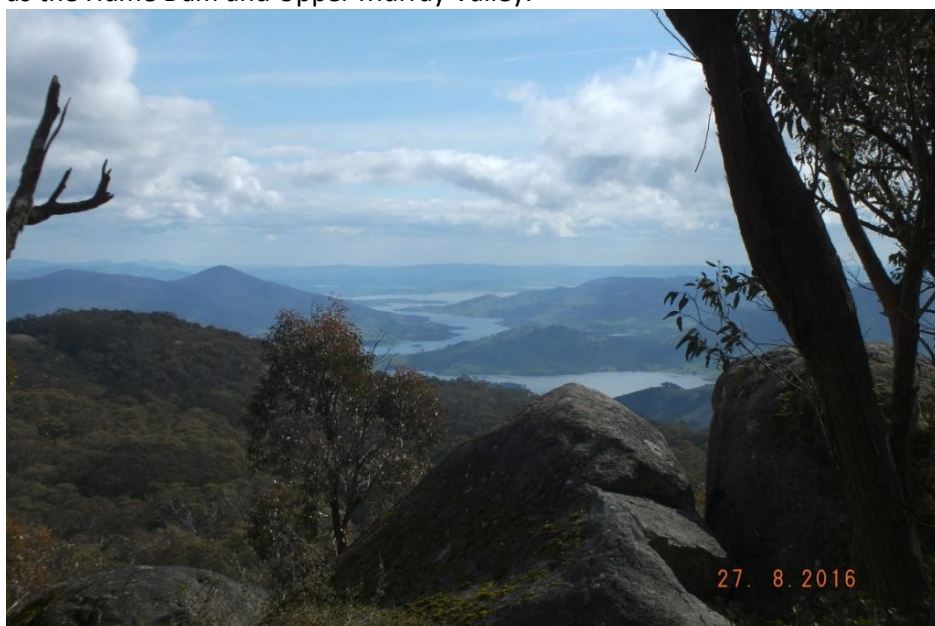
View from near the 1041m summit, looking towards Lake Hume.

The views along the walk were spectacular with lovely snow views of both the Victorian and NSW alps as well as the Hume Dam and Upper Murray Valley.