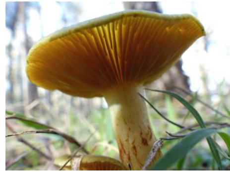
Gilled fungus: Dermocybe austroveneta – ‘Green Cortinar’. Note the remains of a fine, cobwebby veil on stem, coloured ochre by spores (N Blair)