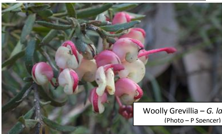
Woolly Grevillia – G. lanigera