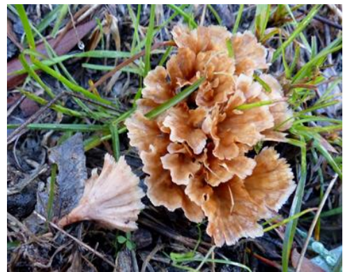
A leathery pored fungus: Podoscypha petaloides – ‘Rosette or Wine-glass Fungus’