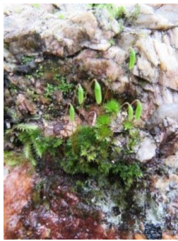
Unidentified moss and leafy Liverwort