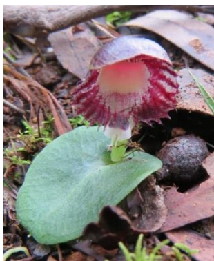
Veined Helmet Orchid (D Andrews)

After lunch we drove on to Lockhart's Gap and took the southern track on the Eskdale Spur. The bank was a mass of mosses ( Braunia , Breutelia and Dawsonia ) and lichen, including Heterodea , Cladia and Cladonia species. There were many orchid leaves but only a few Corybas diemenicus (Veined Helmet Orchid), and several specimens of Tall Greenhoods, with very few fully developed. Woolly Grevillea was conspicuous in flower along the bank (photo Page 1)