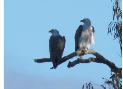
Australasian Grey Teal Azure Kingfisher.....White-bellied Sea Eagles